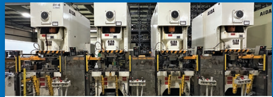
(30) 220 Ton Gap Frame Presses

CIA-INDUSTRIAL.COM 2020 DUNLAP ST. CINCINNATI, OH 45214 513.241.9701