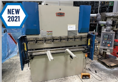
33 Ton x 63" Baileigh CNC Brake