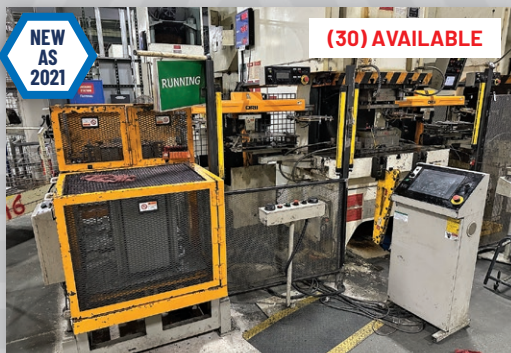
(30) Orii Servo Transfer, Load and Unload Robots