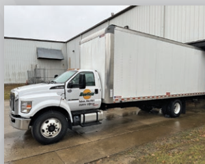
2021 Ford F-750 Box Truck