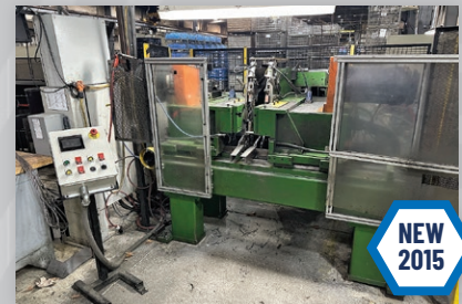
Haven 939 D.E. Finisher