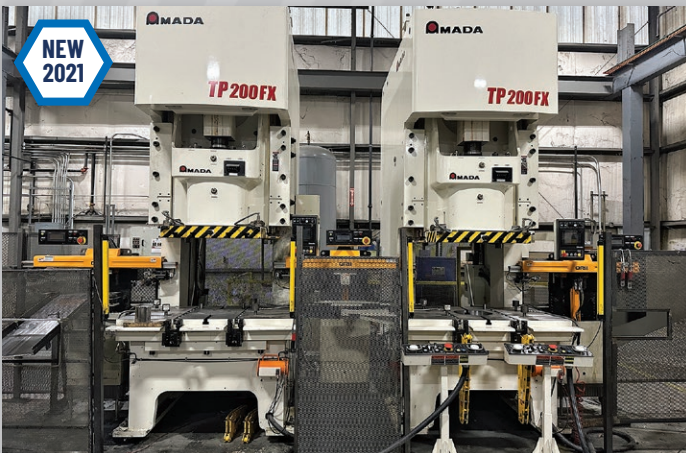
(3) 220 Amada TP200FX Gap Frame Presse