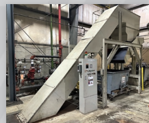
Steel Belt Scrap Conveyor System