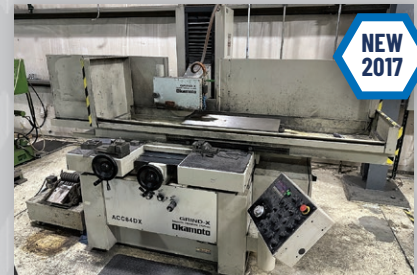
16" X 32" Okamoto ACC-84DX Grinder