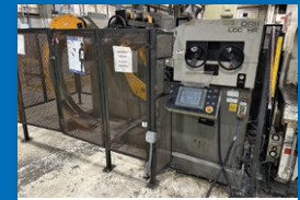
Orii Feed Lines