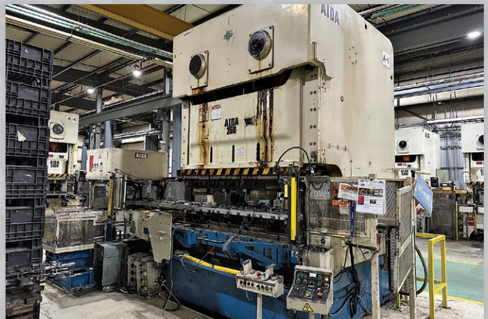
(2) 275 Ton Aida NC2-250(2) Double Crank Gap Frame Presses