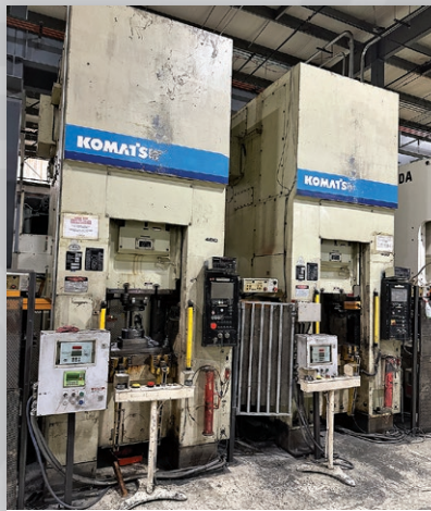
440 Ton Komatsu L1-C400 Link Drive Presses