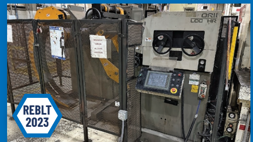
(5) Orii Compact Servo Feed Lines