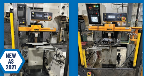
(30) Orii Servo Transfer Robots