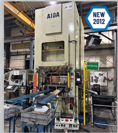
550 Ton Aida S1-5000E SSSC Press