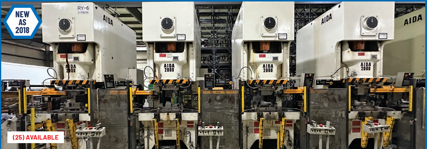
(25) 220 Ton Aida Model NC1-2000(2)E Single Crank Gap Frame Presses

INSPECTION: Day Prior from 10:00 AM to 4:00 PM or by appointment with jeffjr@cia-industrial.com