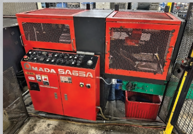
Amada SA65A Saw w. 24' Feed