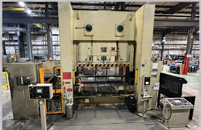
330 Ton Aida and 440 Ton Komatsu SSDC Presses