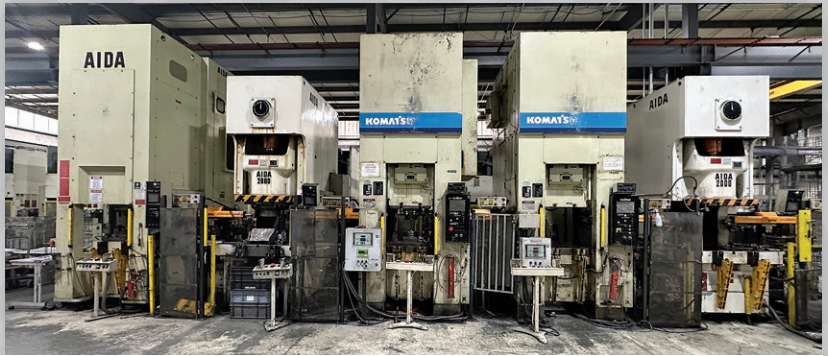
(4) Different Press Lines w. up to (12) Presses Including Orii Transfer, Load and Unload Robots