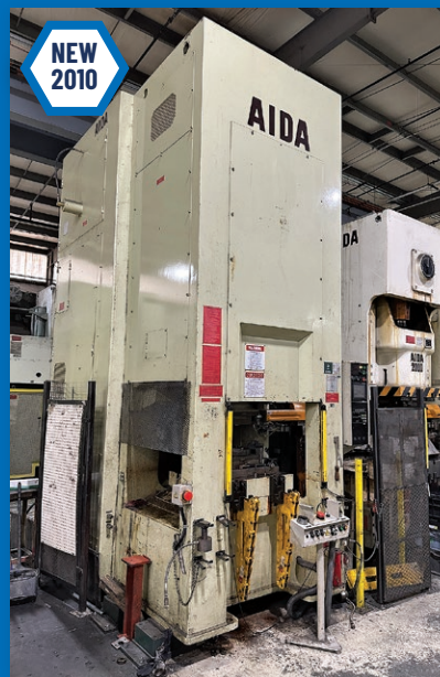
630 Ton Aida K1-6300 Knuckle Joint Press