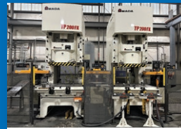
Amada Presses New 2021