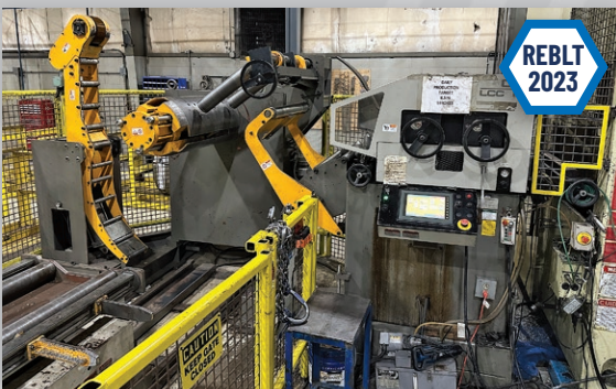
(5) Orii Compact Servo Feed Lines