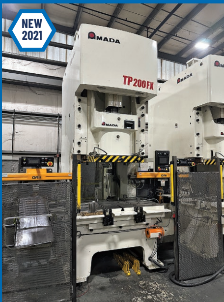
(3) 220 Amada TP200FX Gap Frame Press