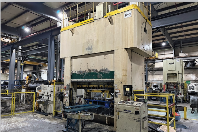
440 Ton Komatsu Model L2M400-3BM SSDC Press