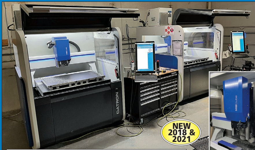
(2) Datron M8Cube B CNC Machining Centers

auctioneers | appraisers | since 1961 | cia-auction.com | info@cia-auction.com 2020 Dunlap St., Cincinnati, Ohio 45214 Phone 513-241-9701 Fax 513-241-6760