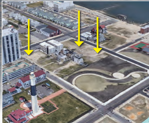
7 Lots in the Lighthouse 1 Tourism District