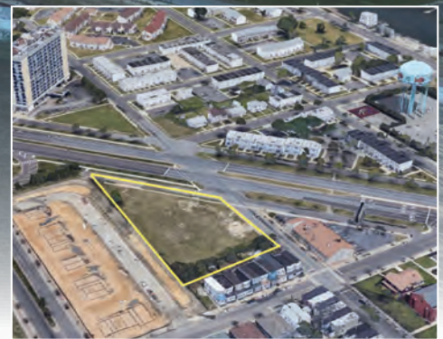
1+/- Acre Development Site RM-2 Zoning