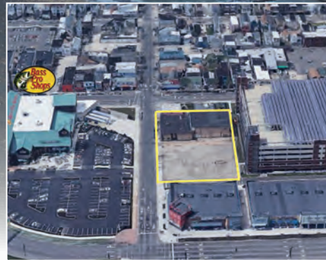
.7 acres lot with 5,460 SF building Zoning Central Business District