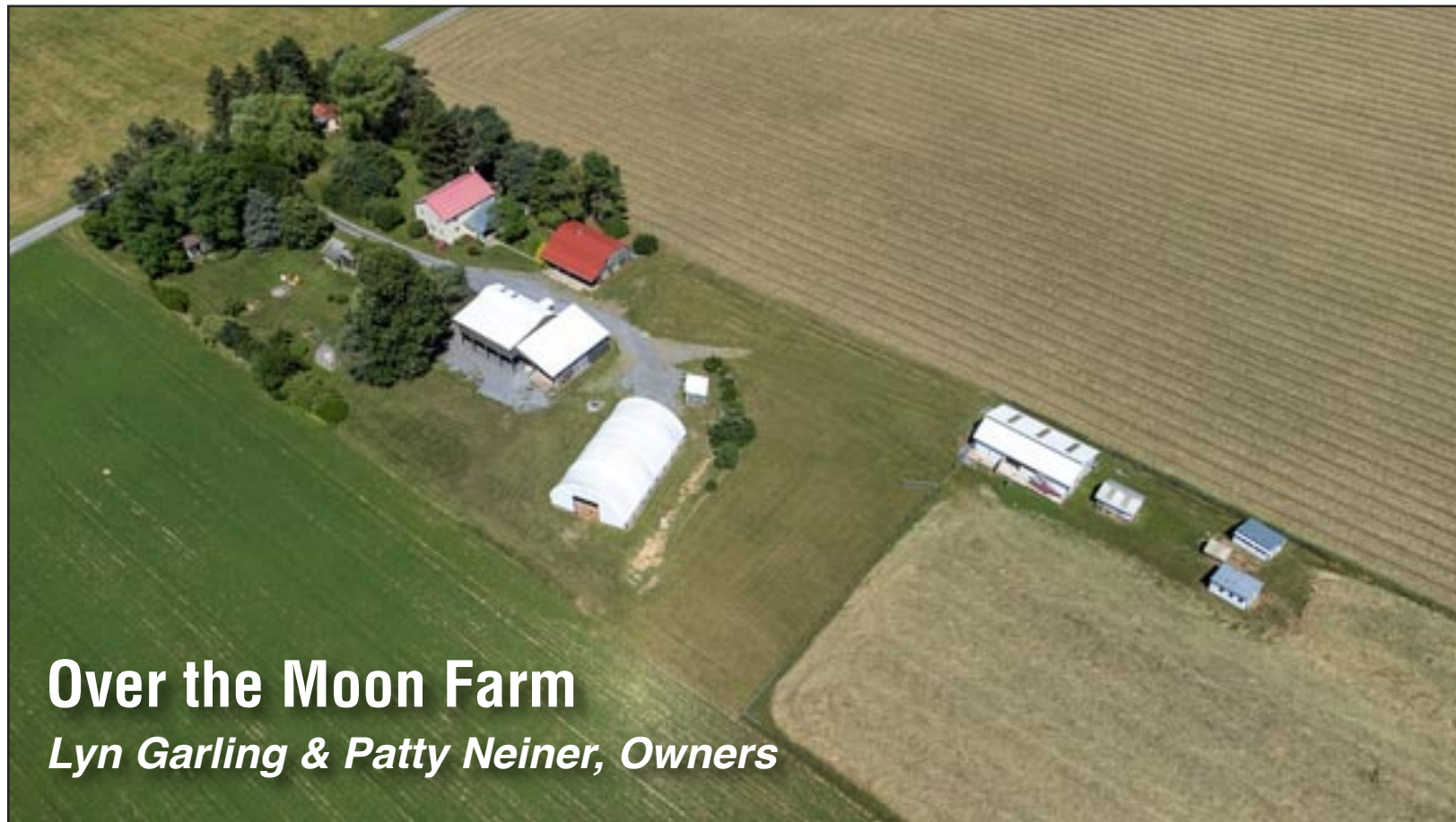
Over the Moon Farm Lyn Garling & Patty Neiner, Owners

18' Grumman Alum. Canoe; Paddles, Life Jackets; Water Gear; Camping Gear; Complete Camping Kit; 2003 Pontiac Vibe w/161, K mls. w/Hitch.