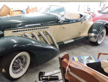
1936 Auburn Replica