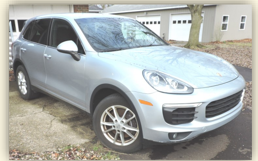
2016 PORSCHE Cayenne