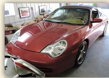
2003 PORSCHE Convertible