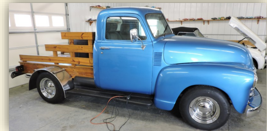
1950 Chevy Pickup w/Mercedes Diesel Motor