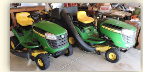
(2) JD D-110 Riding Mowers