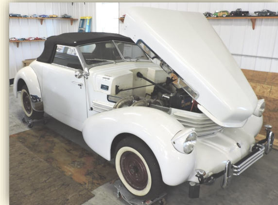
1965 CORD Replica, Convertible