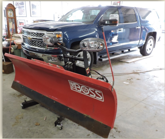
2015 Chevy 4X4 Plow Truck, 4-Door

JD MOWERS * GARAGE ITEMS ENCLOSED TRAILER -(2) JD D-110 Riding Lawn Mowers; Lawn Cart; Radial Arm Saw; Chop Saw; Double Grinder; Garden Kind Tiller; 1.5 Ton Hydraulic Hoist; Hand Tools; Misc. Items. -20 Ft. HAULMARK Enclosed Trailer