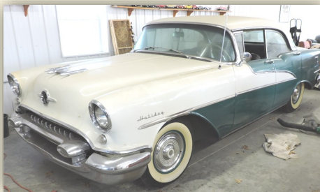
1955 Oldsmobile "Holiday" 324 cubic Rocket V-8 "Ed's Merry-Oldsmobile-88"