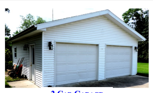
2 CAR GARAGE