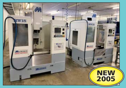
(2) Milltronics Model RW18 CNC VMC