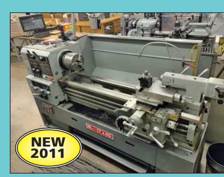
17" X 40" Kent USA Model ML-1740T Gap Bed Lathe