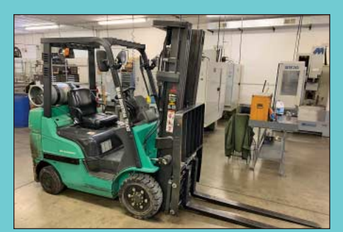
5,000 Lb. Mitsubishi Model FGC25N LP Gas Solid Tire Lift Truck