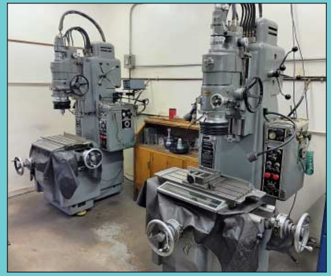
(2) Moore Model No. 3 Jig Grinders

16" Deltronic Model DH216 Optical Comparator with MPC-5 Deltronic Control 31" Saito Model EBC-1-H16 Precision Bench Center Mitutoyo Model RA-116 Roundness Tester; S/N 200112 12" Fowler Sylvac Hi-Cal 300 Digital Height Gauge (4) 12" Fowler Sylvac Z-Cal