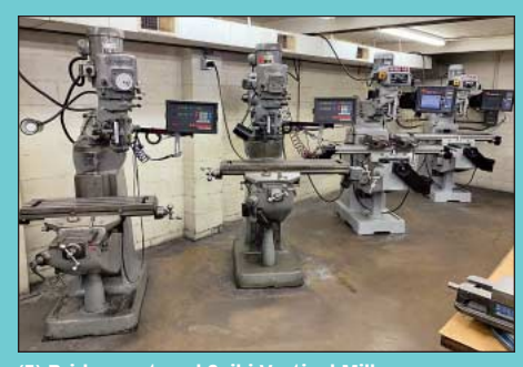
(5) Bridgeport and Seiki Vertical Mills