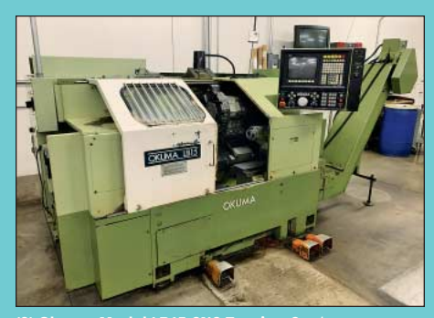
(2) Okuma Model LB15 CNC Turning Centers