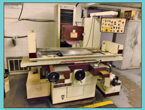
12" X 24" Chevalier Model FSG-3A224H Surface Grinder

(2) 10 HP Saylor-Beall Vertical Tank Mounted Compressors