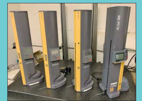
(5) 12" Fowler Sylvac 360 Digital Height Gauges