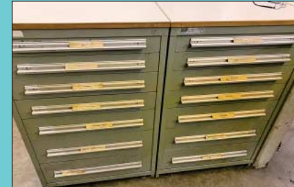
Large Quantity of Perishable Tooling