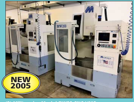
(2) Milltronics Model RW20 CNC VMC