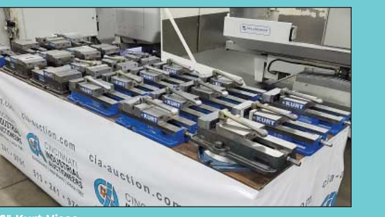
(25) 6" Kurt Vises