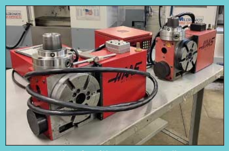
(2) 6" Haas 4th Axis with Servo Controllers