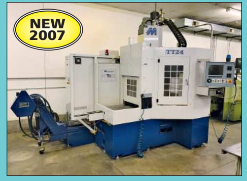
Milltronics Model TT24 Twin Pallet CNC VMC