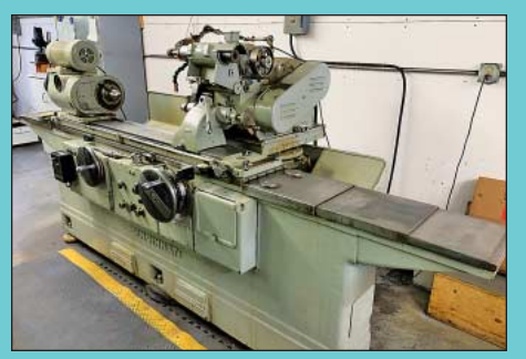
12" X 30" Cincinnati Universal Cylindrical Grinder Drop Down ID Spindle

5" X 12" Covel Model 512H Plain Type Cylindrical Grinder