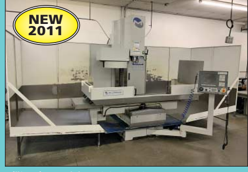
Milltronics Model RH30 CNC VMC

(2) Okuma Model LB15 CNC W Turning Centers; S/N A219, N