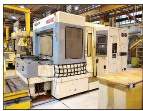
(7) Niigata Model HN50C CNC Horizontal Machining Centers