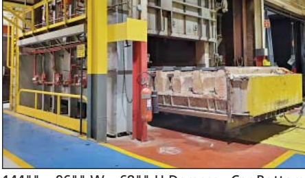
Furnace to 1,800 Degree F