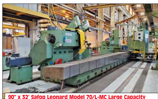
90" x 32' Safop Leonard Model 70/L-MC Large Capacity CNC Lathe with Milling & Y-Axis