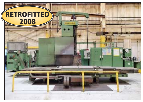
5" Giddings & Lewis Horizontal Boring Mill w/ Fanuc Control