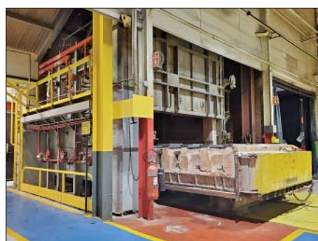
144"" x 96"" W x 68"" H Dempsey Car Bottom