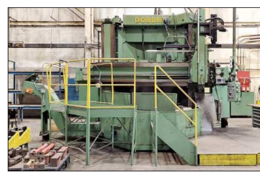
96" Dorries Vertical Boring Mill