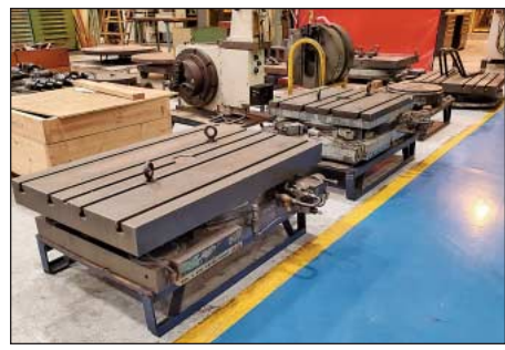
Numerous Large Capacity Rotary Tables

4,000 Lb. Spreader Beam (4) HD Chain & Rigging Box w/ (2) Leg Chains up to 20K Capacity Chains, Hooks, Lifting Clamps, Clevises, Shackles, Rings & More Rigging / Lifting Equipment Variety of Lifting Magnets; up to 3,000 Lb.