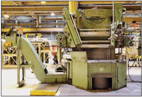
64" Bullard Cutmaster Vertical Turret Lathes