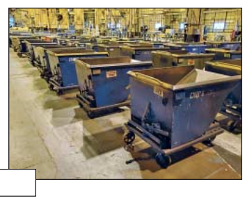
Late Model Plant Support Equipment, Air Compressors, Forklifts, Hoppers