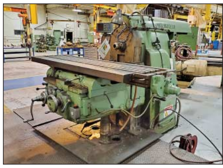
Huge Quantity Toolroom Machinery