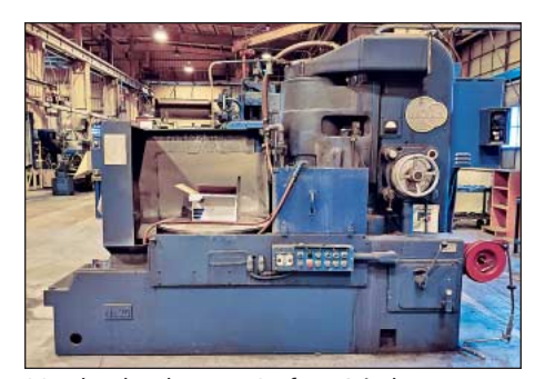
36" Blanchard Rotary Surface Grinder