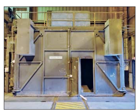
28' x 20' x 13' H Wheelabrator Air Blast Booth