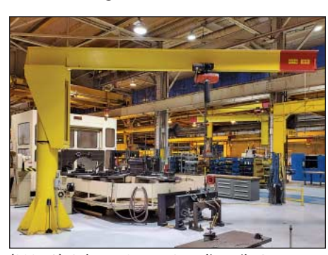
(200 +/-) Column & Free-Standing Jib Cranes to 4-Ton