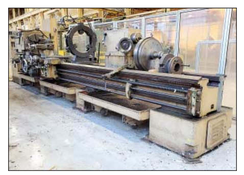
32" X 16' Leblond Model 3220-25 HD Engine Lathe