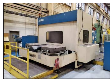
Toyoda Model FH100 CNC Horizontal Machining Center