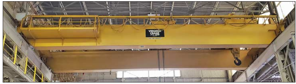
75 Ton/ 30 Ton x 60' Span Virginia Overhead Bridge Crane