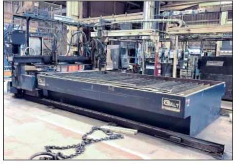
8' X 15' MG Plasma Table w/ Hyper-Therm Plasma Supply