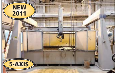
8' X 12' PAR Systems Waterjet Cutting Machine