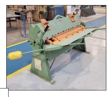
Complete Fabricating Department, Rolls, Shears, Brakes and Related