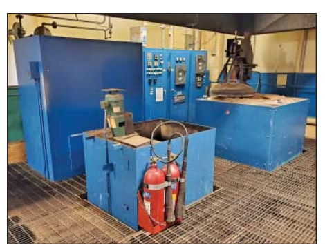
Various Heat Treat Furnaces and Related