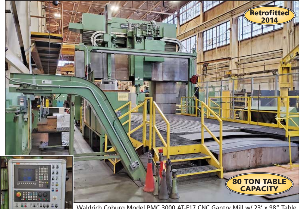
Waldrich Coburg Model PMC 3000 AT-F17 CNC Gantry Mill w/ 23' x 98" Table (Retrofitted Control 2014)

Virginia Crane Double Girder Top Running Overhead Bridge Crane; S/N VC95-751, 75 Ton Hoist & 30 Ton