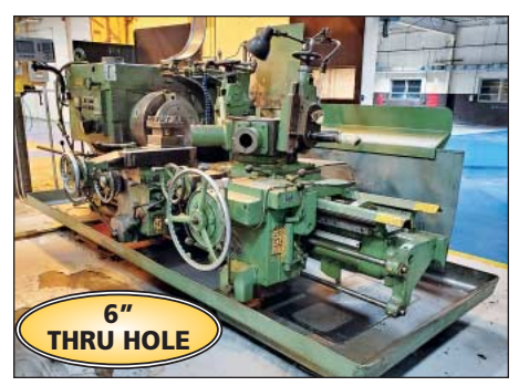
Warner & Swasey No. 3A Turret Lathe w/ 6" Thru Hole