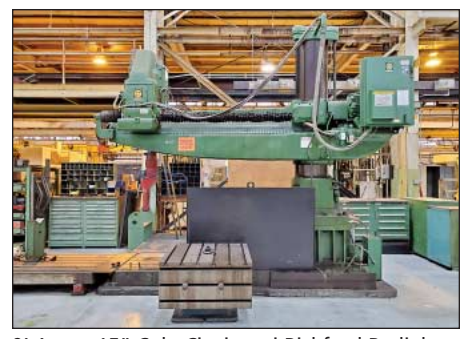
9' Arm x 15" Col. Cincinnati Bickford Radial Arm Drill