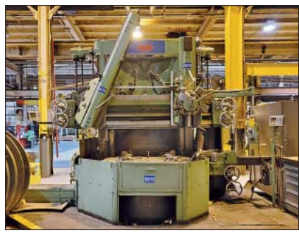
64", 54", 42", 30" Bullard Cutmaster Vertical Turret Lathes