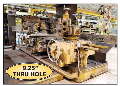
Warner & Swasey No. 4A Turret Lathe w/ 9.25" Thru Hole