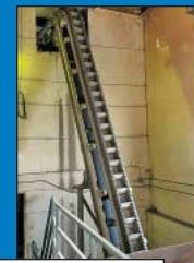
Complete Concrete Batch Plant