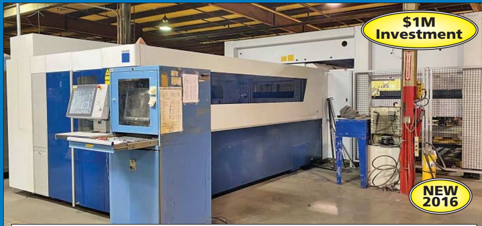
4,000-Watt Trumpf TruLaser 3030 Fiber Laser w/ Liftmaster Loader, 5' x 10', Low Hours

For Detailed Specifications, Photos, Link To Online Bidding And Terms Of Sale.