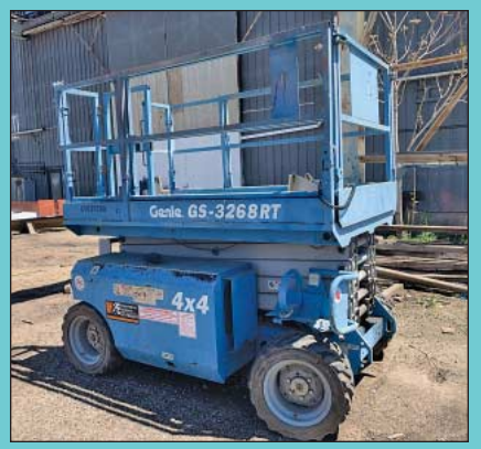
1,000 Lb. Capacity Genie Model GS-3268RT Unleaded Fuel Pneumatic Tire 4X4 Scissor Lift