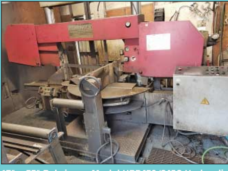
17" x 33" Behringer Model HBP430/845G Hydraulic Mitre Base Dual Column Horizontal Band Saw