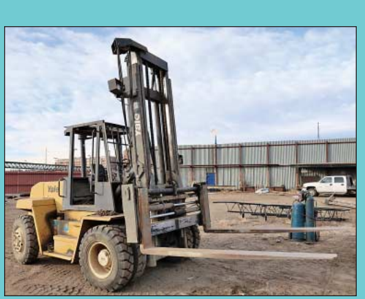
21,000 Lb. Yale Model GDP210DAN Diesel Pneumatic Tire Lift Truck

(12) Thermal Dynamics Fabstar 4030 Mig Welders w/ Wire Feeds (3) Lincoln Powerwave C300 Mig Welders