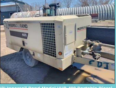
(2) Ingersoll Rand Model VHP-400 Portable Diesel Powered Air Compressors