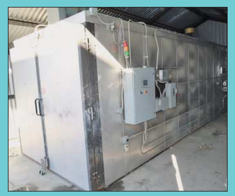
8' x 8' x 20' Spray Tech Systems Model 080820 Natural Gas Drive-In Powder Coat Oven