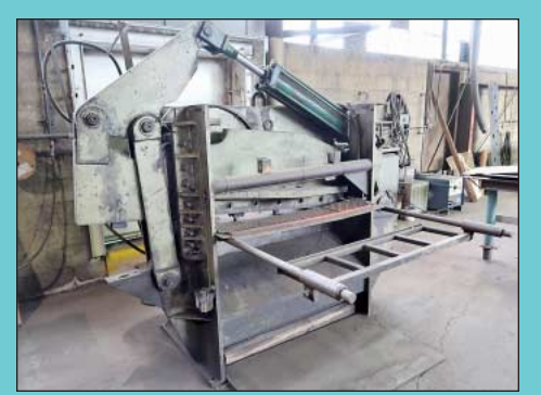
3/8" x 4' Metal Muncher Model PS4800 Hydraulic Plate Shear