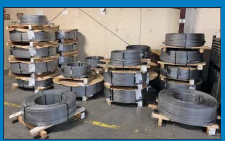
Approx. 200 Ton Steel Coil Inventory