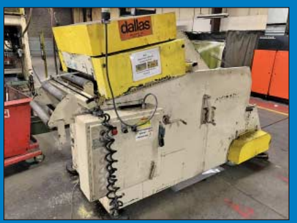
10,000 Lb. x 24" Dallas Model 24 x 60 x 10000 Cradle Straightener