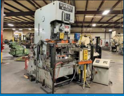
121 Ton Stamtec Model G1-110 Single Crank OBI Press