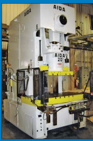
220 Ton Aida Model C1-20(1) Single Crank Gap Frame Press

Inspection by appointment with jeffjr@cia-auction.com