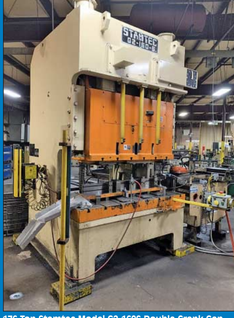
176 Ton Stamtec Model G2-160S Double Crank Gap Frame Press

STEEL COIL INVENTORY Approx. 200 Ton Steel Coil Inventory , See website for complete