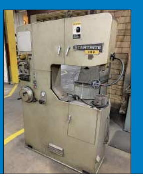
Misc. Toolroom Machinery, Drills, Saws, Tooling and Support Equipment