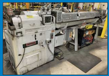
5/16" Lewis Model 2CV Wire Straight and Cut w/ 8' Rack