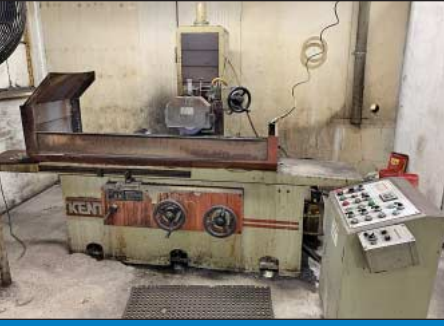
16" x 40" Kent Model KGS410AHD Hydraulic Surface Grinder