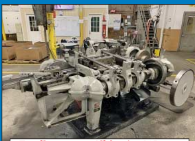
(7) Nilson Four Slides to 1/4 Models 4F, 3F, S3, S2F, S1