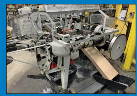
3/16" Nilson Model S3 Wire Four-Slide