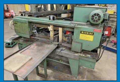
Doall C-916 Horizontal Band Saw