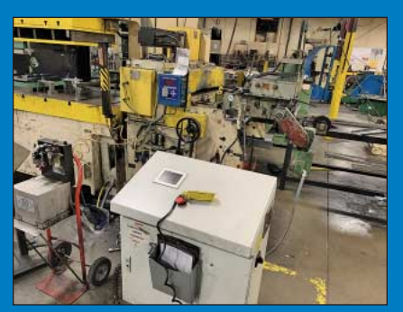
24" Perfecto Model 00-24 Servo Feed