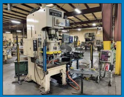
66 Ton Stamtec Model G1-60 Single Crank Gap Frame Press