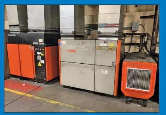
(2) Mattei Rotary Screw Air Compressors