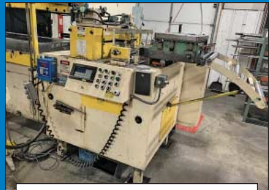
(30+) Pcs. Press Feed Equipment