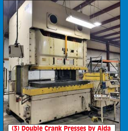
and Stamtec to 275 Ton

INSPECTION: Day Prior from 10AM to 4PM or by appointment with jeffjr@cia-auction.com