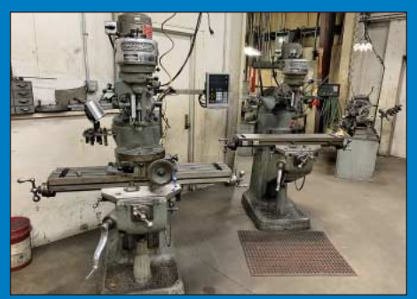
(4) 1-HP Bridgeport 8-Speed Vertical Mills; Modern DRO's