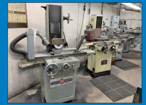
(6) Hand Feed Surface Grinders

Inspection Tools; 14" Optical Comparator w/ Late Model DRO, Granite Plates, Height Gages, Calipers, Mics, Small Machinery, Grinders, Sanders, Arbor Presses