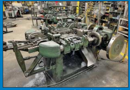
(2) 3/16" Nilson Model 3F Flat Strip Four-Slides