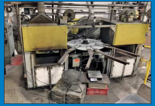
(2) Corrotec 3-Position Rotary Table Automatic Plastisol Dip Coating Machines