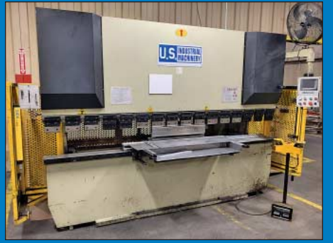
88 Ton x 10' US Industrial Model US8810 Hydraulic Press Brake