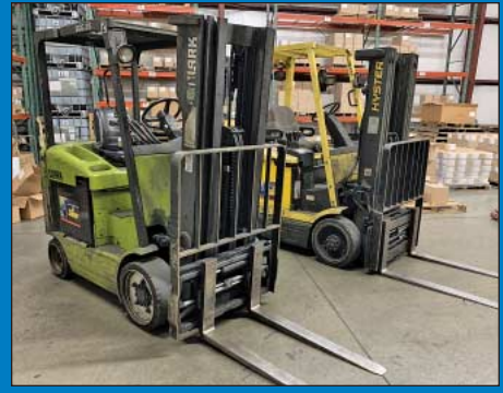
Electric Forklifts, Man Lifts, Battery Chargers