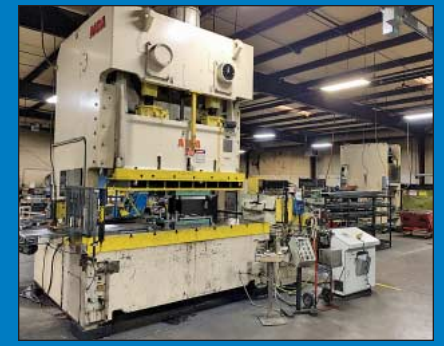
220 Ton Aida Model C2-20(2) Double Crank Gap Frame Press