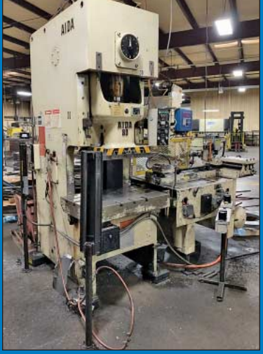
88 Ton Aida Model NC1-80(2) Single Crank Gap Frame Press

66 Ton Stamtec Model G1-60 Single Crank Gap Frame Press; s/n 0362, 4.73" Stroke, 35 – 90 SPM, 11.82" SH, 2.96" Adj. (1996)