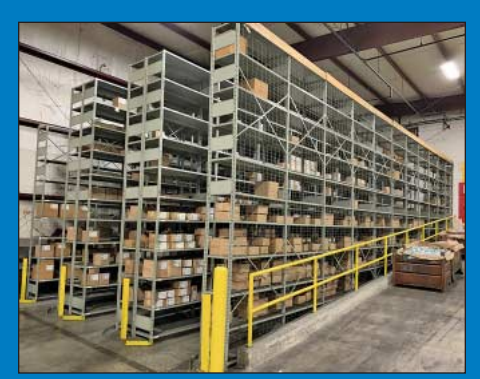
(66) Sections 18" x 48" x 174" High Adjustable Steel Shelving