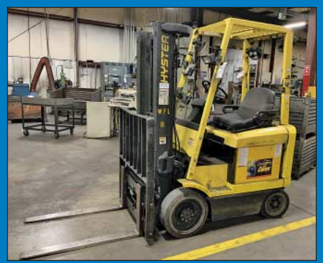
(2) 5,000 Lb. Hyster Model E50XM2-27 Sit Down Electric Forklifts