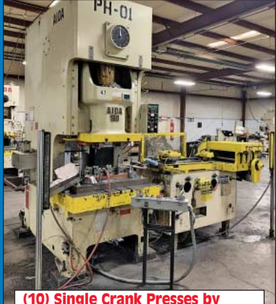
Aida, Stamtec and Rousselle