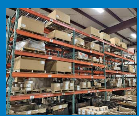
(50) Sections 42" x 108" x 15' High USP Adjustable Beam Pallet Rack