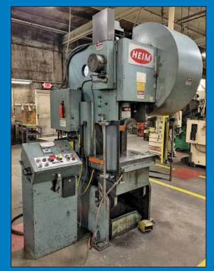
50 Ton Heim Model 5G OBI Press

(2) Accra Wire Control Model F200 Motorized Horizontal Uncoilers (5) American Steel Line Uncoilers from 3,000 to 6,000 Lb.