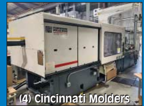
(4) Cincinnati Molders