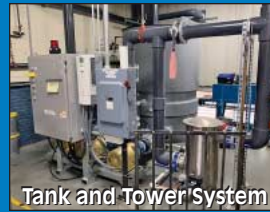
Tank and Tower System