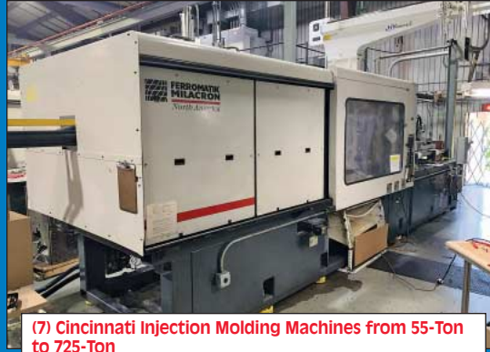
(7) Cincinnati Injection Molding Machines from 55-Ton to 725-Ton