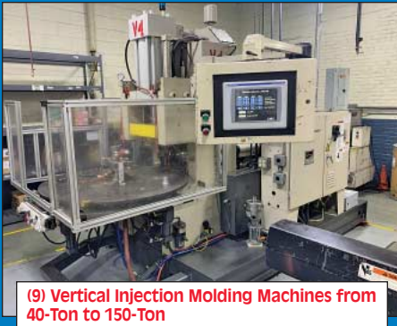
(9) Vertical Injection Molding Machines from 40-Ton to 150-Ton