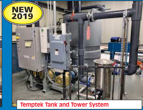
Temptek Tank and Tower System