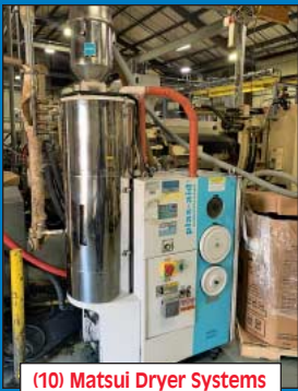
(10) Matsui Dryer Systems