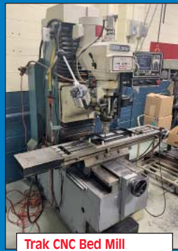
Trak CNC Bed Mill