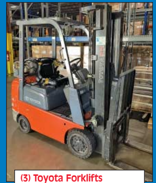
(3) Toyota Forklifts