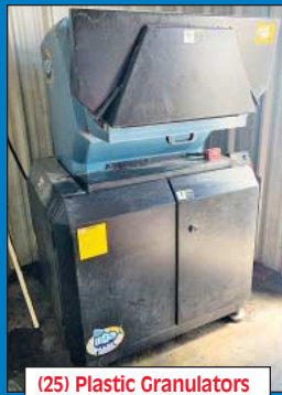
(25) Plastic Granulators