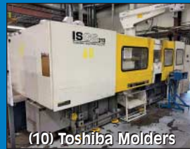
(10) Toshiba Molders

Contact Information 2020 Dunlap St. Cincinnati, Ohio 45214 Phone 513-241-9701 Fax 513-241-6760 www.cia-auction.com