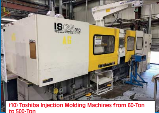
(10) Toshiba Injection Molding Machines from 60-Ton to 500-Ton

INSPECTION: DAY PRIOR FROM 10:00 AM TO 4:00 PM