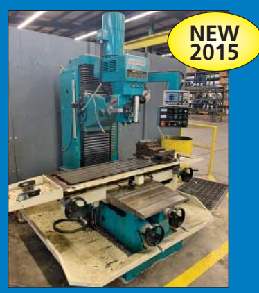
7.5-HP Clausing Model SUP8BV Bed Mill

7.5-HP Clausing Model SUP8BV Bed Mill; s/n 151225, 16" x 62" Table, DRO, PB Control (New 2015)