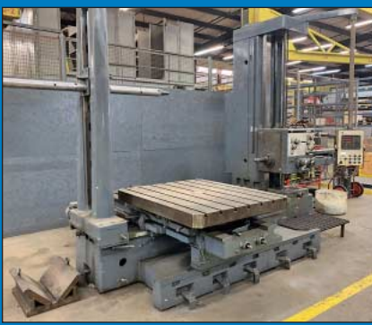
4" Summit Rotary Table Horizontal Boring Mill