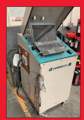
Large Quantity Electric Motor Test Equipment