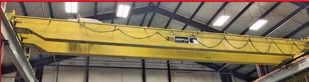
20 Ton and 7.5 Ton x 60' Span Conco Overhead Bridge Cranes, Radio Remote