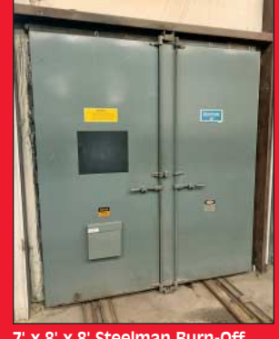
7' x 8' x 8' Steelman Burn-Off Oven