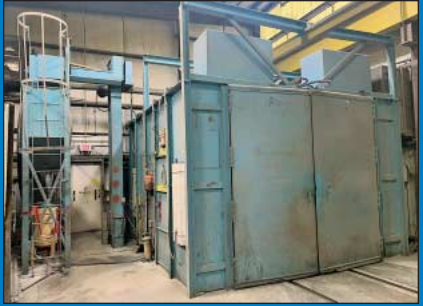
14' x 16' x 10' High Approx. Drive-In Blast