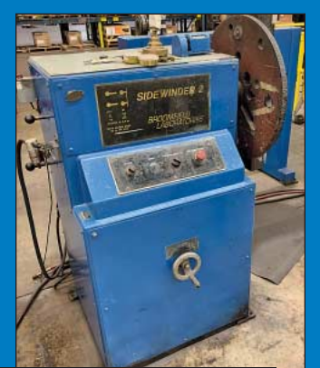
Large Quantity Electric Motor Test and Rebuild Equipment