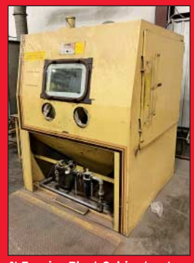
4' Empire Blast Cabinet w/ Rotary Table