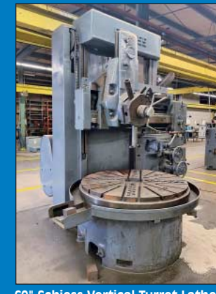
60" Schiess Vertical Turret Lathe