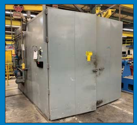
(5) Burn-Off Ovens to 8' x 8' x 12