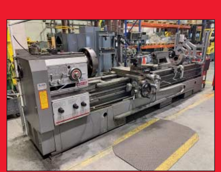
30" / 40" x 156" and 120" Lion Gap Bed Engine