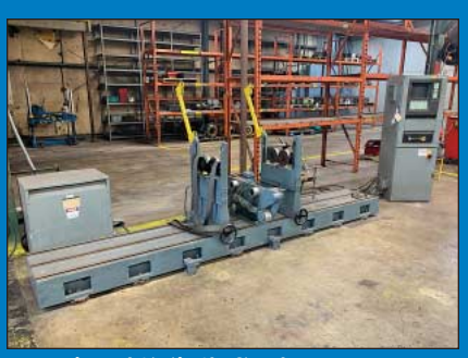
Dynamic and Static Shaft Balancers