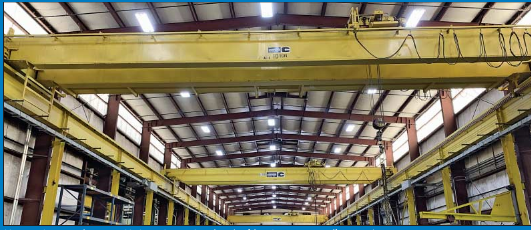
20-Ton, 10-Ton and 5-Ton x 60' Span Conco Overhead Bridge Cranes w/ Radio Remote