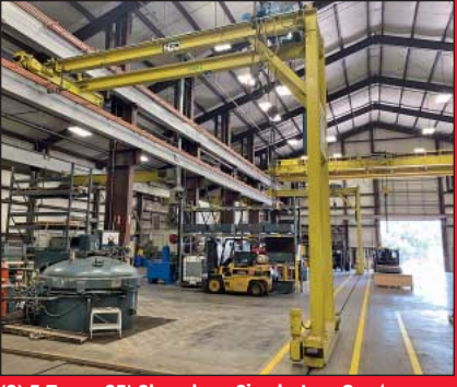
(2) 5 Ton x 25' Shawbox Single Leg Gantry Cranes

Adjustable Beam Pallet Rack, Fireproof Cabinets, Oxy-Torch Carts, Die Lift Cart, Warehouse Cart, Electric Hoists, and Related