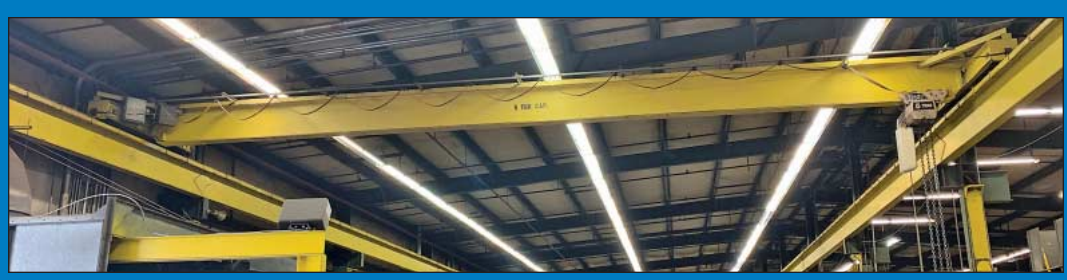
(10) 5-Ton and 3-Ton Single Girder Overhead Bridge Cranes

4" Summit Rotary Table Horizontal Boring Mill; s/n 140.39/609, 4' x 5' Rotary Table, DRO