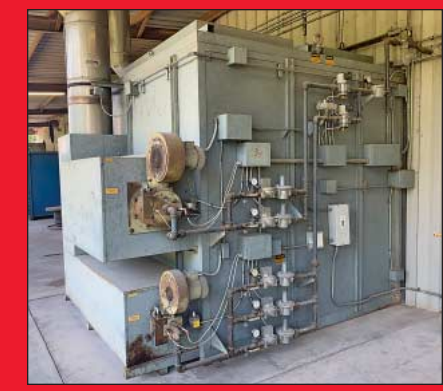
Rear View Steelman Burn-Off Oven