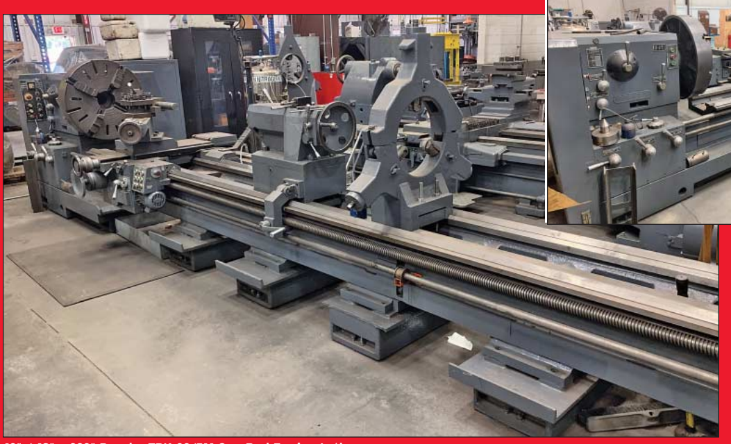
40" / 48" x 220" Poreba TPK-90/5M Gap Bed Engine Lathe