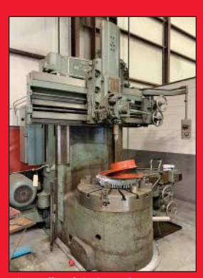
42" Bullard Cutmaster Vertical Turret Lathe