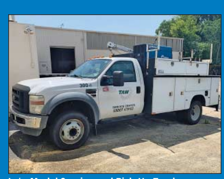
Late Model Service and Pick-Up Trucks