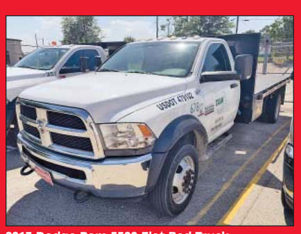
2013 Dodge Ram 5500 Flat Bed Truck, Cummins, 134K