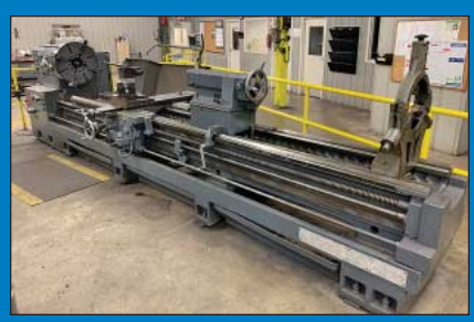
(8) Engine Lathes to 60" x 240" by Mazak and