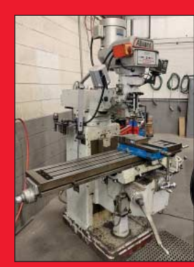
Toolroom Machinery, Mills, Drills, Grinders, Presses