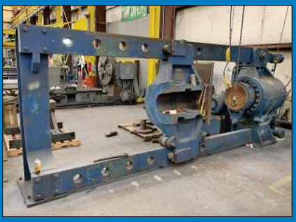
600-Ton Watson Stillman Hydraulic Wheel Press

Equipment ; Heavy Duty Repair Tables, Maintenance Tools, Job Boxes, Parts Washers, Fireproof Cabinets, Platform Scales, Racks