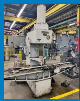
75 Ton Oil Gear Straightening Press