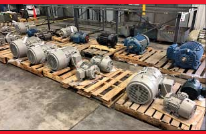
(50) New Electric Motors from 5-HP to 200-HP