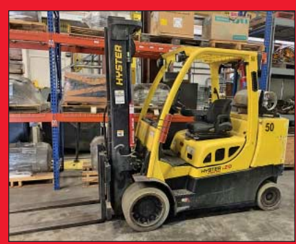
12,000 Lb. Hyster S120FT-PRS LPG Lift Truck, 3,000 Hours