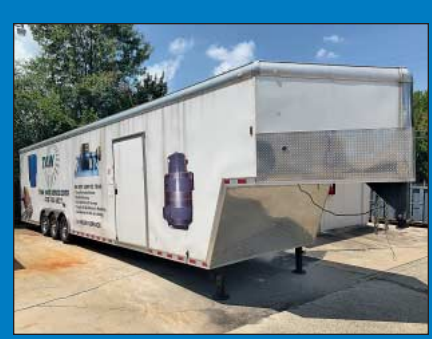
2018 - FVCG 36' Enclosed Gooseneck Trailer