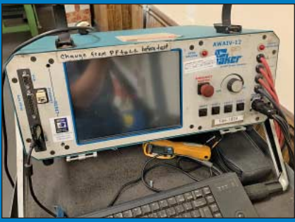
Large Quantity Electric Motor Test and Rebuild Equipment