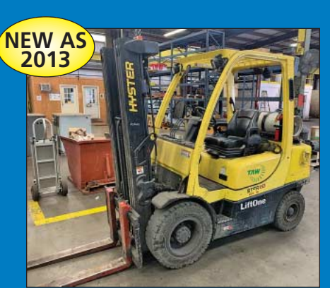
(3) Forklifts to 10,000 Lb. Cap.