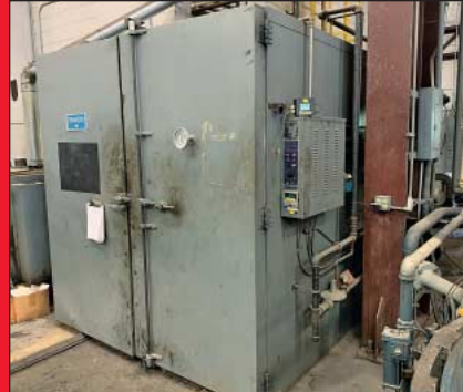
(5) Burn-Off Ovens to 7' x 7' x 12