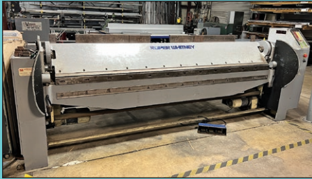
14 Ga. X 10' Roper Whitney Model AB1014K Autobrake 2000 Series CNC Folder