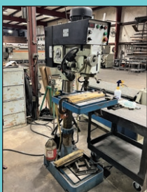
Baileigh Model DP-1500VS Floor Drill