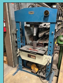
75 Ton Baileigh H-Frame Hydraulic Press