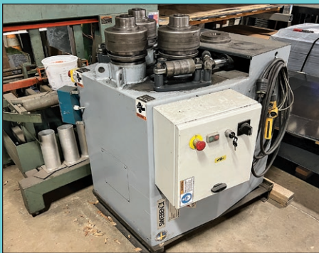
3" X 3" X 3/8" Swebend Model SB3B-85 Hydraulic Angle Rolls