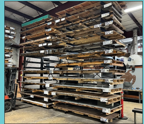
Various Sheet Metal Inventory

55 Ton Cleveland Steel Tool Hydraulic Ironworker 6 Ton Pemsrter Series 4 Hardware Insertion Press; S/N J4-3502 (2006) Pullmax Model P5/2 Circle Shear; S/N 56125 Baileigh Model DP-1500VS Floor Drill; S/N F1503040 Rotex Punch 16 Ga. Tennsmith Model TN Manual Notcher; S/N 05209 30" Pexto No. 132 Kick Shear Combo Disc & Belt Sander Dynabrade Model 64699 Downdraft Grinding Table Falls Products Edge Deburrer *Out of Service* Ellis Horizontal Band Saw