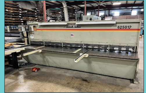
1/4" X 12' Accurshear Model 625012 Hydraulic Shear