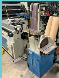
Combo Disc & Belt Sander