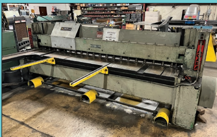
10 Ga. X 10' Niagara Model 610 Hydraulic Shear