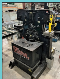
55 Ton Cleveland Steel Tool Hydraulic Ironworker