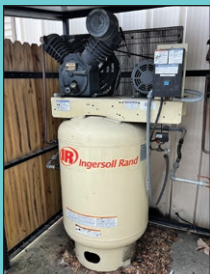
(2) 10 HP Ingersoll Rand Model 2545K10V-3 Vertical Tank Air Compressors