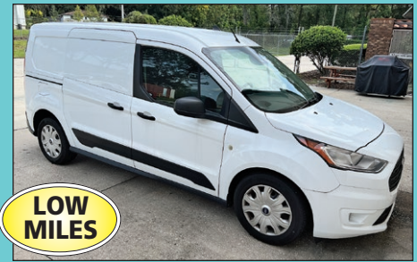
2020 Ford Transit Cargo Van

40' Container 20' Container (6) 4' X 8' Steel Layout Carts (2) Honda EU3000is Super Quiet Inverter Generators Large Quantity of Shop Equipment Including; Ladders, Walk Boards, Portacool Fans, Banding Carts, Electric & Pneumatic Hand Tools, Hardware, Racks, Shelving & More