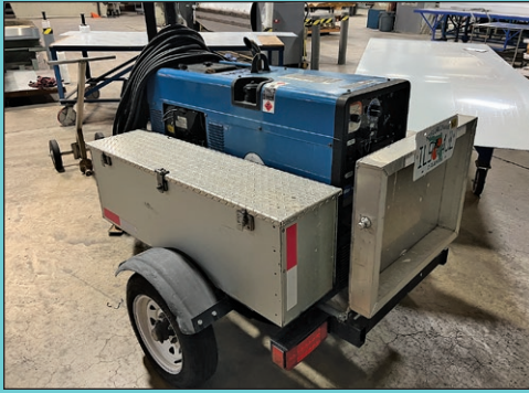
Miller Trailblazer 301G Genset Gasoline Welder Mounted to Single Axle Trailer