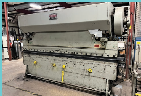
60 Ton X 12' Chicago Model 1012L Mechanical Press Brake