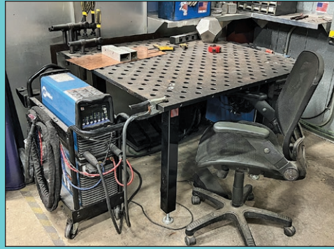
(2) Miller Dynasty 350 Tig Welders w/ Chillers