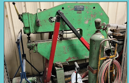
Pullmax Model P5/2 Circle Shear