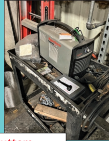
Late Model Miller Tig & Mig Welders, Hypertherm Plasma Cutters