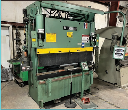
70 Ton X 6' Betenbender Model 6-70T Hydraulic Shear