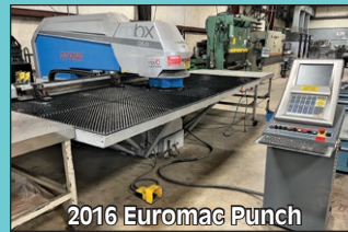
2016 Euromac Punch

Contact Information 2020 Dunlap St. Cincinnati, Ohio 45214 Phone 513-241-9701 Fax 513-241-6760 www.cia-auction.com