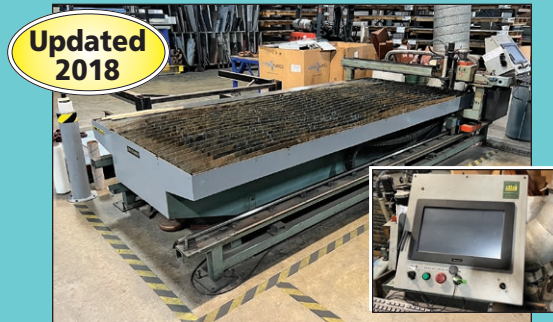
5' X 12' Lockformer Model Vulcan CNC Plasma Cutting Table