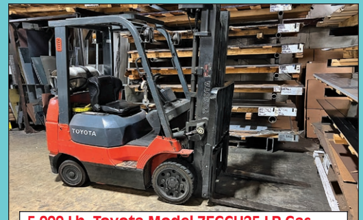
5,000 Lb. Toyota Model 7FGU25 LP Gas Solid Tire Lift Truck