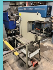
6 Ton Pemsrter Series 4 Hardware Insertion Press