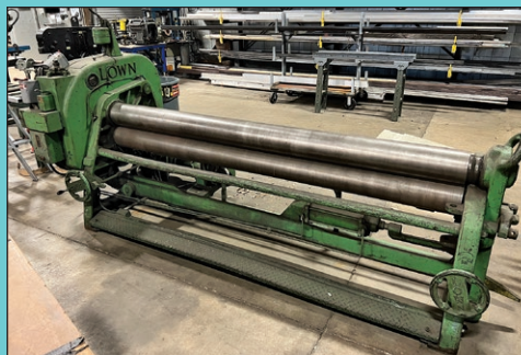
8' Lown Model B603 Plate Rolls