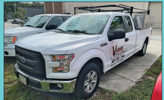
2016 Ford F-150XL Pickup Truck

CINCINNATI INDUSTRIAL AUCTIONEERS auctioneers | appraisers | since 1961