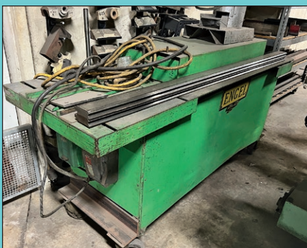
Engel Model 825 Eight-Stand Roll Former