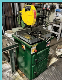
14" Doringer D350 Cold Saw