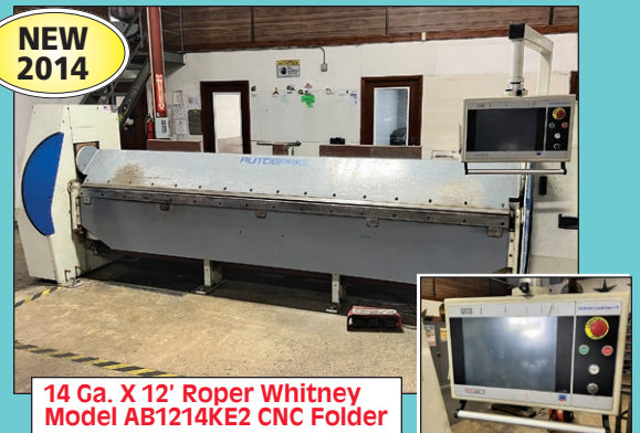
14 Ga. X 12' Roper Whitney Model AB1214KE2 CNC Folder