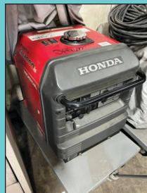
(2) Honda EU3000is Super Quiet Inverter Generators