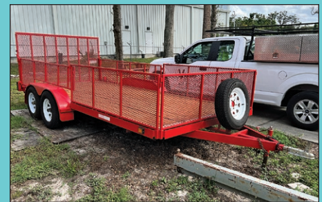
16' Tandem Axle Wood Deck Trailer