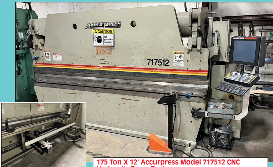
175 Ton X 12' Accurpress Model 717512 CNC Hydraulic Press Brake