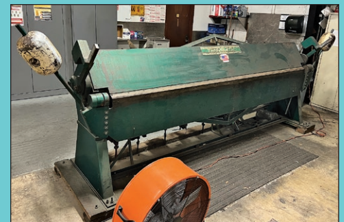
16 Ga. X 12' Tennsmith HB121 Apron Brake