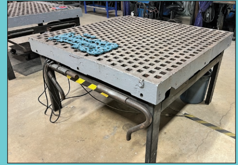
(2) 4' X 4' Acorn Welding Tables