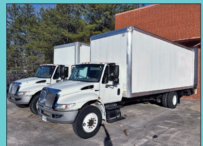
(2) International 24' Box Trucks