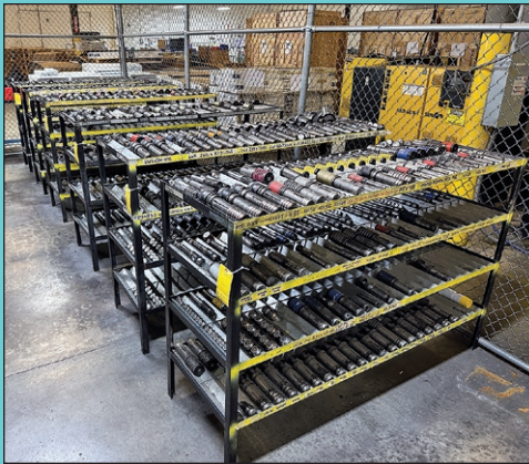
Large Quantity Turret Punch Tooling