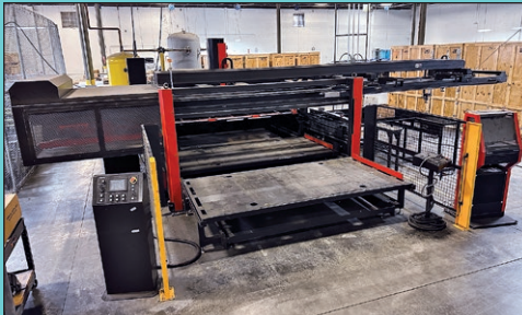
Amada RMP510MTK Sheet Loader, Stand Alone (2013)