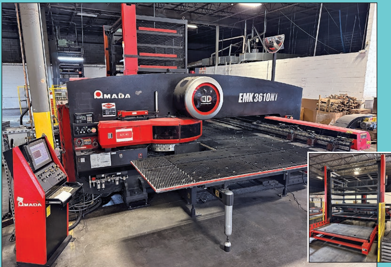
Amada EMK3610NT CNC Turret Punch w/ ASR510M Tower Loader (2005)

INSPECTION: Day prior from 10:00 AM to 4:00 PM or by appointment with jeffjr@cia-auction.com