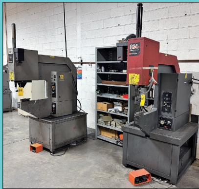
Auto-Sert & Haeger Hardware Insertion Presses