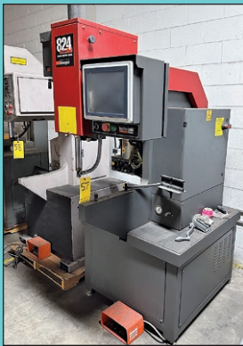
(4) Haeger Hardware Insertion Presses