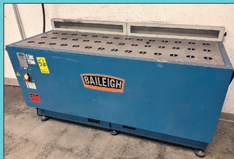
Baileigh Downdraft Grinding Table