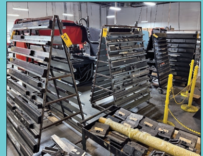
Large Quantity Press Brake Tooling