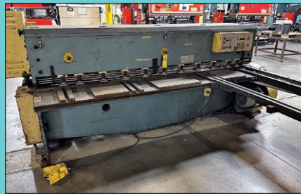
.17" x 98" Amada N-2545 Shear