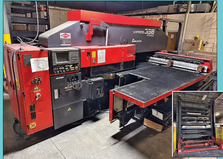
Amada Vipros 358 King II CNC Turret Punch w/ ASR510 Sheet Tower Loader (2000)