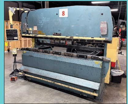
125 Ton x 118" Amada RG-125 CNC Press Brake, NC-9EX