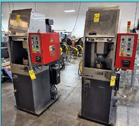
(2) Amada Togu III Auto Punch Grinders