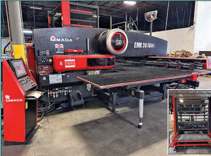
Amada EMK3610NT CNC Turret Punch w/ ASR510M Tower Loader (2005)