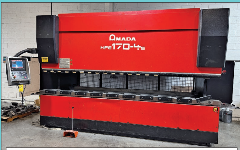
187 Ton x 14' Amada HFE-170-4S CNC Press Brake (2006)