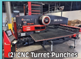
(2) CNC Turret Punches

Contact Information 2020 Dunlap St. Cincinnati, Ohio 45214 Phone 513-241-9701 Fax 513-241-6760 www.cia-auction.com