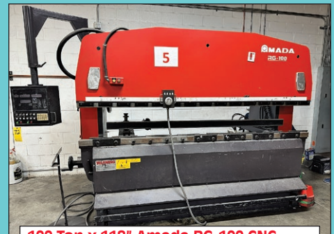
100 Ton x 118" Amada RG-100 CNC Press Brake, NC-9EXII (2000)