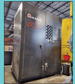
Amada EZ-Cutter System (2011)