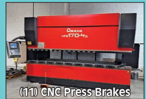
(111) CNC Press Brakes