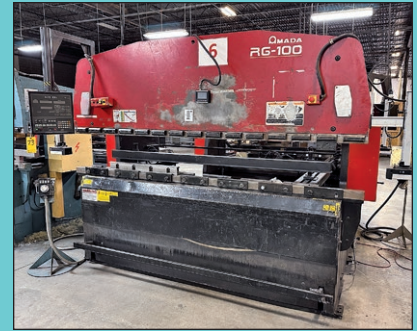
(2) 100 Ton x 98" Amada RG-100 CNC Press Brakes, NC-9EX