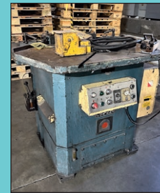
8-5/8" x 8-5/8" x 1/8" Amada CSW-220 Notcher