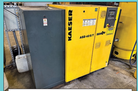
Kaeser ASD-40ST Air Compressor