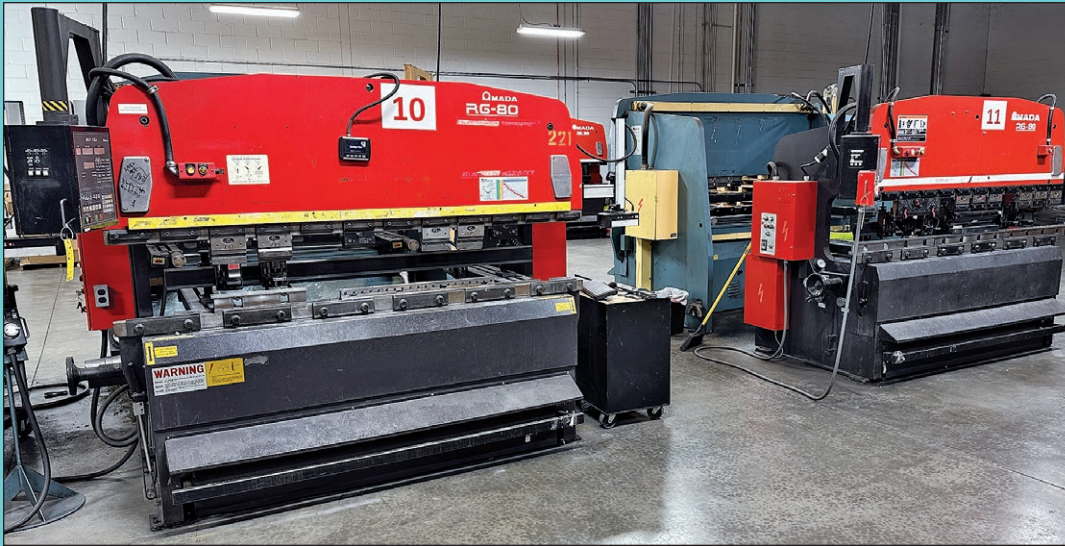
(6) 80 Ton Amada RG-80 CNC Press Brakes