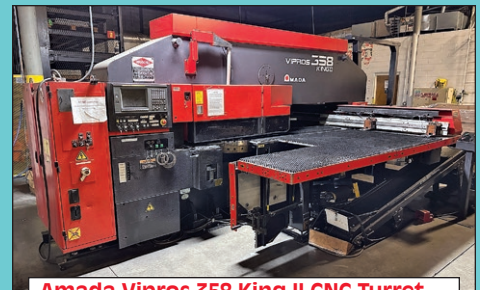
Amada Vipros 358 King II CNC Turret Punch w/ ASR510 Sheet Tower Loader (2000)