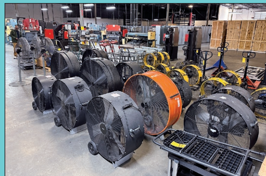
Office Furniture, Racks, Carts, Tools, Cabinets, Misc.