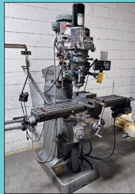
Bridgeport Black Tag Vertical Mill