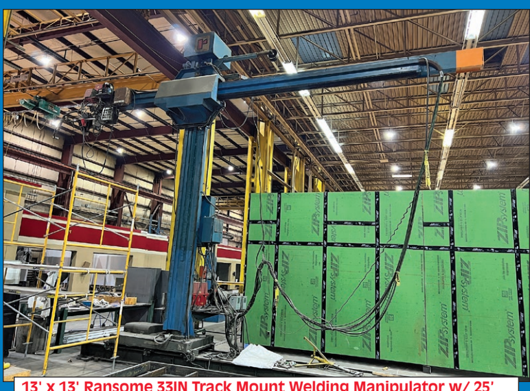
13' x 13' Ransome 33IN Track Mount Welding Manipulator w/ 25