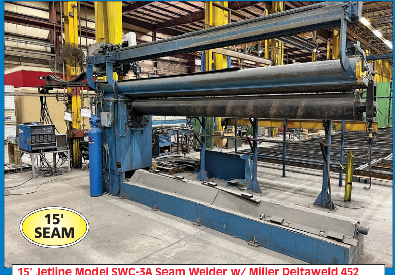
15' Jetline Model SWC-3A Seam Welder w/ Miller Deltaweld 452

INSPECTION: Day Prior from 10:00 AM to 4:00 PM or by appointment with jeffjr@cia-auction.com