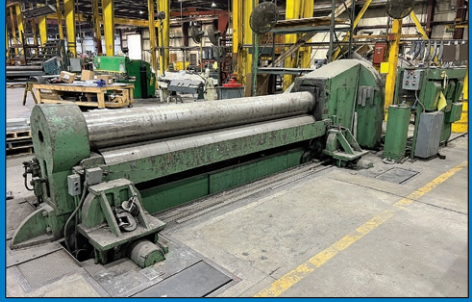
(3) Bertsch Mechanical Plate Rolls, 12', 10' and 6'