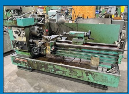
Harrison and SBL Engine Lathes