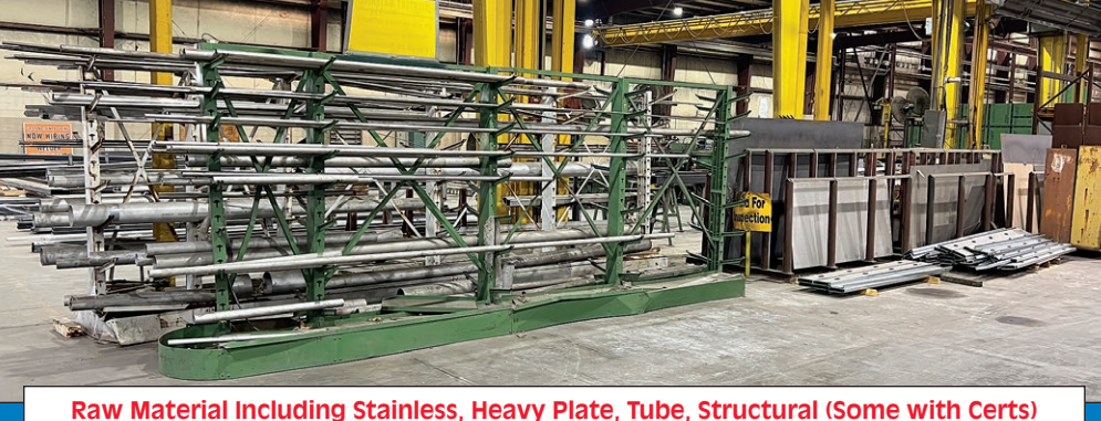
Roll Geared, Lower Rolls Grooved 3SX46X183,

Longitudinally, Air Cylinder for Drop End Operation, 10-HP Main