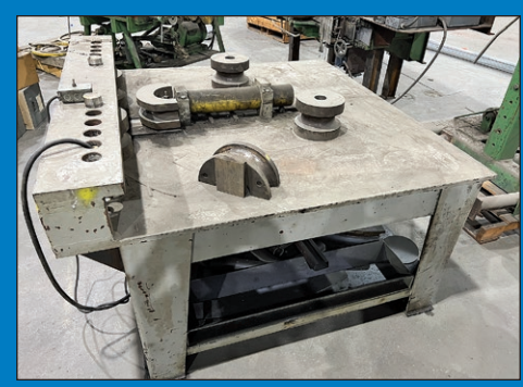
(2) Huth Style Horizontal Hydraulic Benders w/ Dies