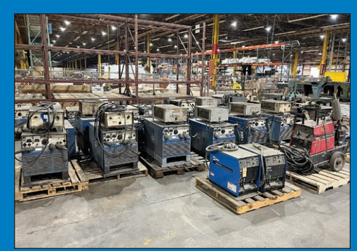
Welding Equipment and Accessories