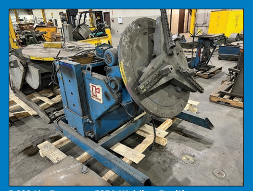
3,000 Lb. Ransome 30PA Welding Positioner