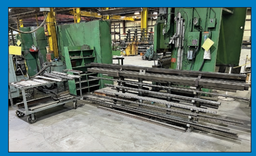
Heavy Press Brake Dies, 12' 4-Way

6' x 7" Dia. Bertsch No. 7B Mechanical Plate Roll; s/n 9386, 5/16" Boiler Duty, 1/4" Pipe Duty, Rear