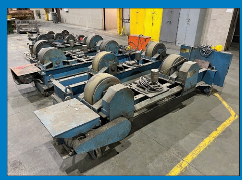
(2) 40 Ton Aronson WRD40 Tank Turning Roll Sets