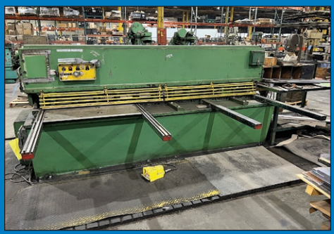
1/4" x 10' Summit Hydraulic Power Squaring Shear