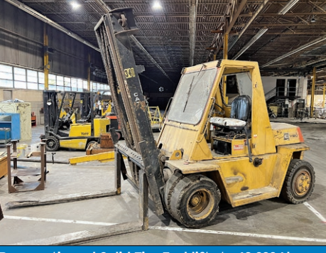
Pneumatic and Solid Tire Forklifts to 12,000 Lb.

(10) Cantilever Bar Racks, Various Size and Style