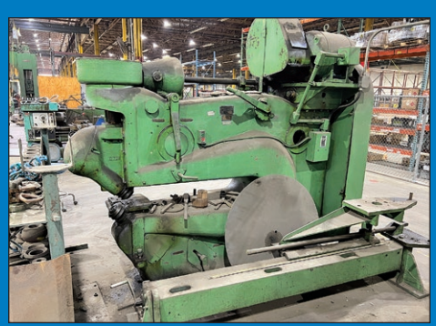
48" and 36" Quickwork Circle Shear and Knuckle Flangers