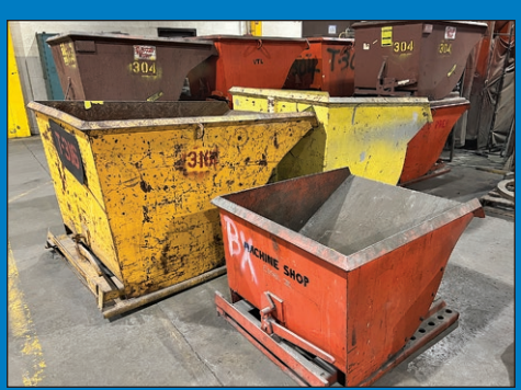
(15) Self Dumping Hoppers from 1/2 to 2 Yard