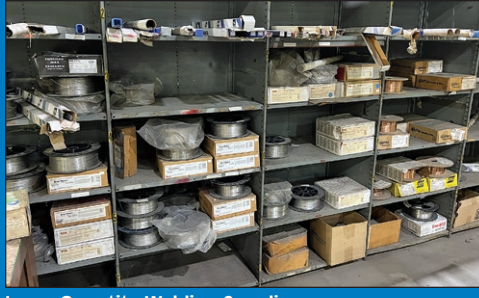
Large Quantity Welding Supplies