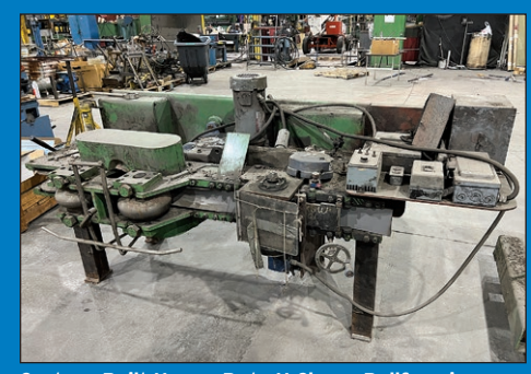
Custom-Built Heavy-Duty U-Shape Rollforming