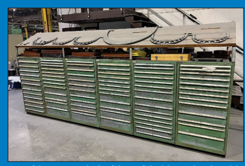
(10) Vidmars Loaded with Perishable and Indexable Tooling