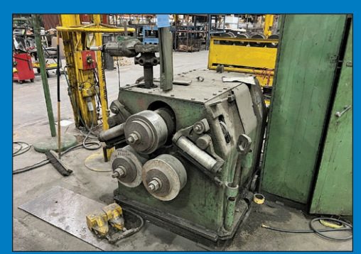
Kling and Sesco Angle Rolls