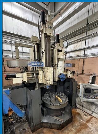
60" Gray Model VMB-6 CNC Vertical Turret Lathe