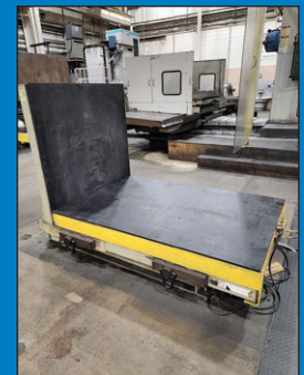
10,000 Lb. Electric Hydraulic Upender