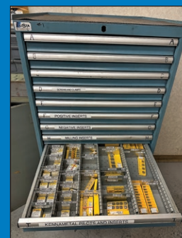
Lista Cabinet Loaded with Inserts