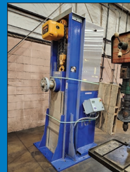
4 Ton Capacity Rotating Fixture