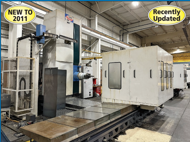
(5) 5.12" SNK Nissin NB130P Rotary Table CNC Horizontal Boring Mills