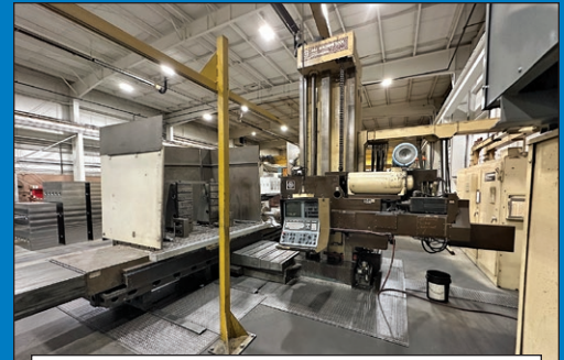
5" Giddings & Lewis G50-T CNC Horizontal Boring Mill