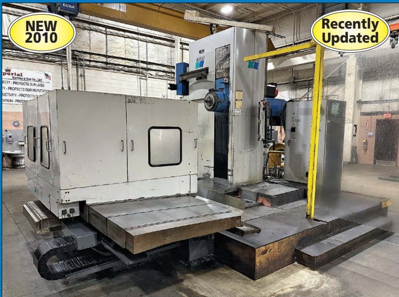
4.3" SNK Nissin NB110T Rotary Table CNC Horizontal Boring Mill