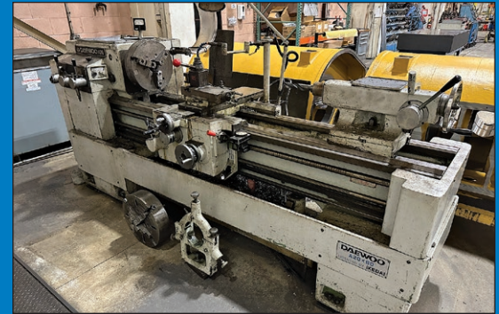
20" x 60" Daewoo Ikegai A20 Engine Lathe

Scissor Tables, Pneumatic and Electric Power Tools, Tool Boxes, Hand Tools, Racks, Fans, 2-Door Cabinets, Ladders, Maintenance Supplies