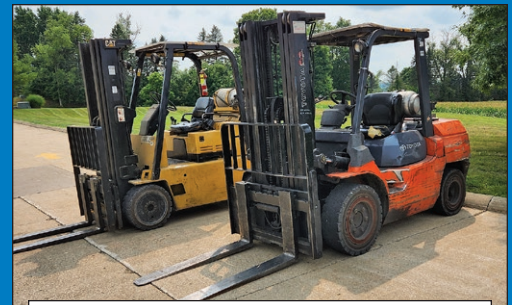
Toyota and Caterpillar LPG Forklifts to 10,000 Lb.