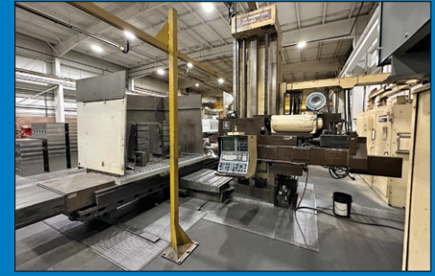
5" Giddings & Lewis G50-T CNC Horizontal Boring Mill