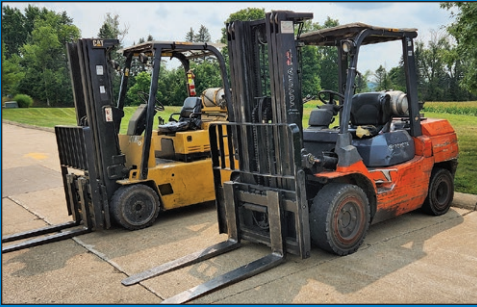
Toyota and Caterpillar LPG Forklifts to 10,000 Lb.