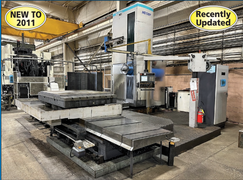
(5) 5.12" SNK Nissin NB130P Rotary Table CNC Horizontal Boring Mills