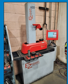
EZ Set 600 Tool Setter