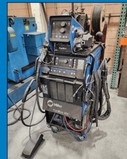
400 Amp Miller Pipe Worx 400 Welder