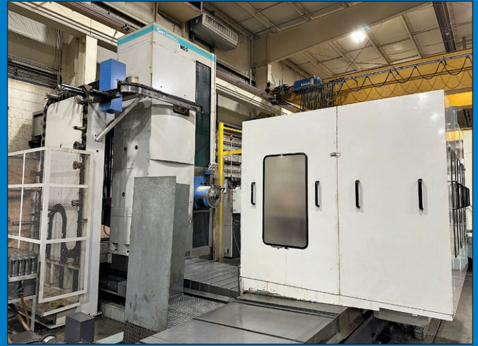
SNK Nissin NB130P Boring Mill - Toolchanger View