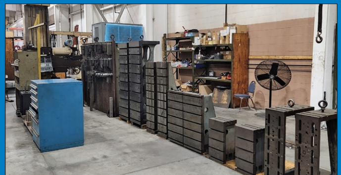
(10) Sets of Large Angle Plates to 4' x 7'

5" Giddings & Lewis Model PC50 CNC Horizontal Boring Mill; s/n 450-192, Machine M2, New Servo Drive 2021, Fagor Control, 48" x 74" Table, Coolant