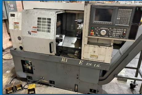
Okuma Heritage ES-L6 Two-Axis CNC Lathe