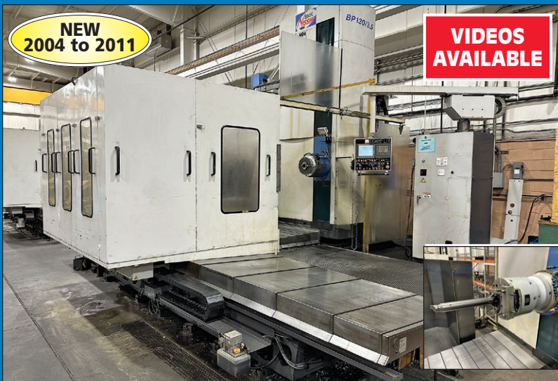
(5) 5.12" SNK Nissin NB130P Rotary Table CNC Horizontal Boring Mills