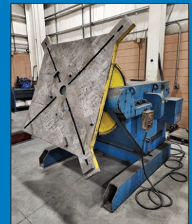
16,000 Lb. Aronson HD160A Welding Positioner