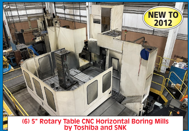
(6) 5" Rotary Table CNC Horizontal Boring Mills by Toshiba and SNK

Contact Information 2020 Dunlap St. Cincinnati, Ohio 45214 Phone 513-241-9701 Fax 513-241-6760 www.cia-auction.com