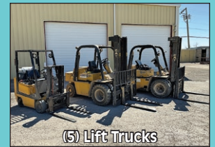
(5) Lift Trucks