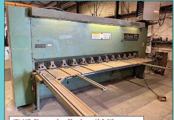
(3) HD Shears by Cincinnati & Niagara