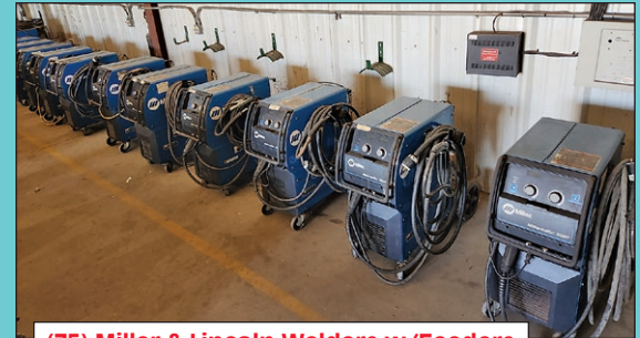
(75) Miller & Lincoln Welders w/Feeders