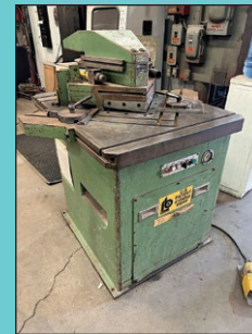
(2) 9" x 9" Boschert LB15 Notchers