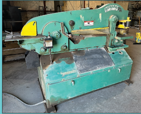
120 Ton Piranha P120 Ironworker