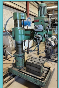
Formosa FM700 Radial Drill Press