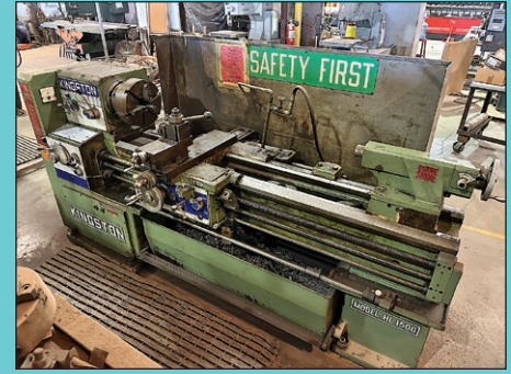
21" x 60" Kingston Model HL1500 Lathe