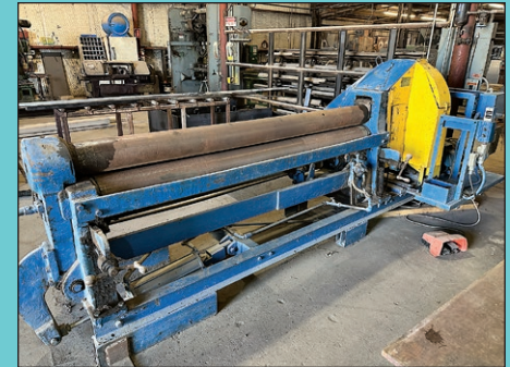
85" Bertsch No. 7 Plate Roll

Large Qty. of Raw Materials, Scrap & WIP: Sheets of Stainless Steel, Aluminum & Steel