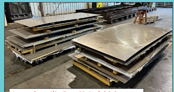
Large Quantity Raw Material & Scrap