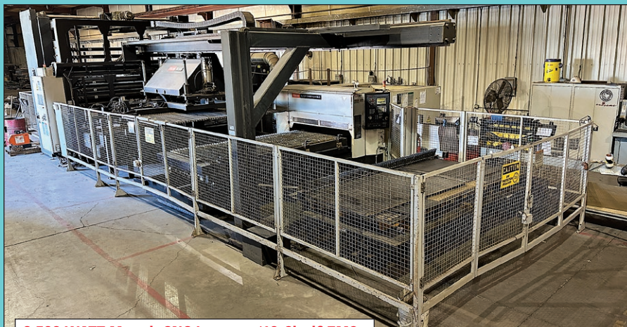
2,500 WATT Mazak CNC Laser w/10-Shelf FMS