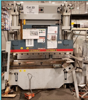
60 Ton x 6' Cincinnati 60 CB2 CNC Press Brake **Located in Columbia, SC**