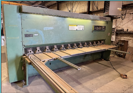
3/8" x 12' Cincinnati 375 x 12FT Shear