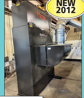
2,500 Watt 5' x 10' Mazak Super Turbo-X510MK II CNC CO2 Laser w/ 10-Shelf FMS