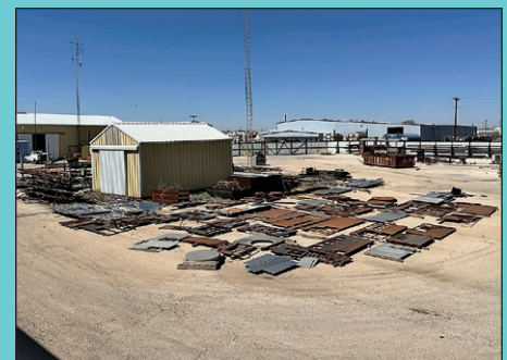
Large Qty. of Raw Materials & Scrap: Stainless Steel, Aluminum & Steel