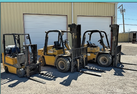
(5) Lift Trucks by CAT & Yale up to 9,000 LB