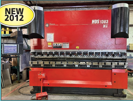
130 Ton x 126.8" Amada HDS-1303NT 8-Axis CNC Press Brake