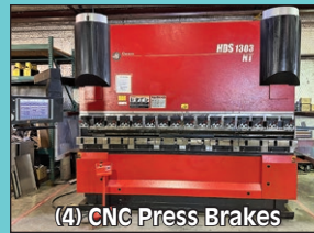
(4) CNC Press Brakes

Contact Information 2020 Dunlap St. Cincinnati, Ohio 45214 Phone 513-241-9701 Fax 513-241-6760 www.cia-auction.com