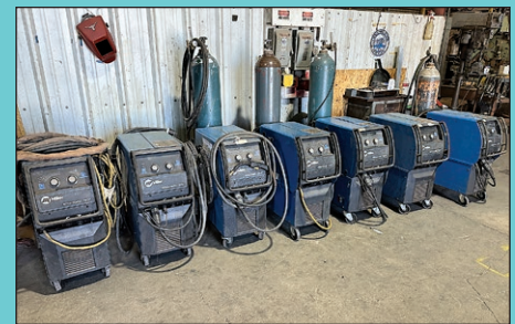
(75+) Miller & Lincoln Welders