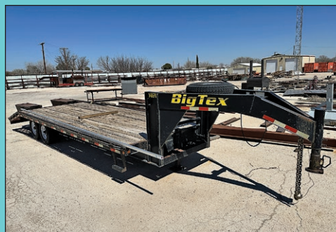
25' Big-Tex 14GN-20+5 5th Wheel Trailer