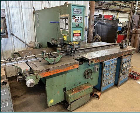
(1 of 4) HD Strippit Punches up to 40 Ton