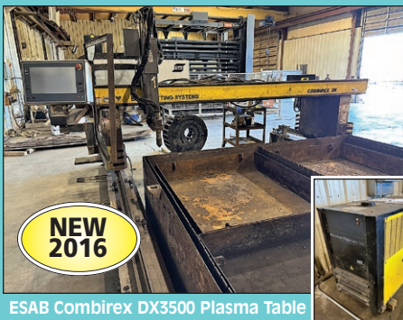
ESAB Combirex DX3500 Plasma Table