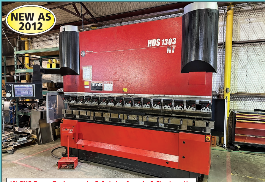
(4) CNC Press Brakes up to 8-Axis by Amada & Cincinnati

INSPECTION: Wednesday, July 19th from 10:00 AM to 4:00 PM or by appt. with ryan@cia-auction.com