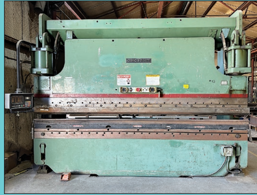
230 Ton x 14' Cincinnati 230CB x 12' CNC Press Brake