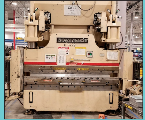
175 Ton x 8' Cincinnati 175 AF X 6 FT. Autoform CNC Press Brake **Located in Columbia, SC**