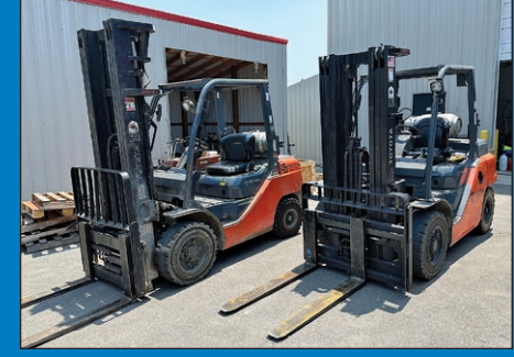
(2) Toyota LPG Pneumatic Tire Forklifts