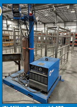
(3) Miller Deltaweld 452 Welders