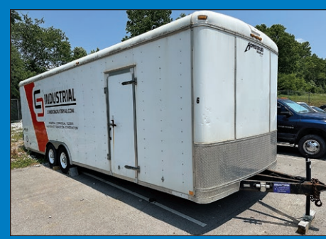
Other Utility and Dump Trailers