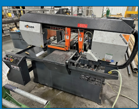
11" x 19" Cosen SH-500M Horizontal Band Saw