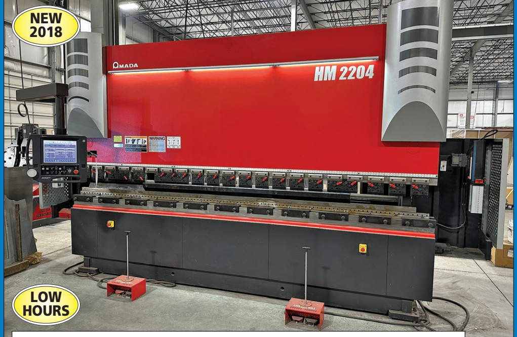
242 Ton x 169" Amada HM2204 CNC Press Brake