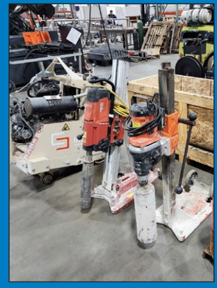
Core Drills and Concrete Saw