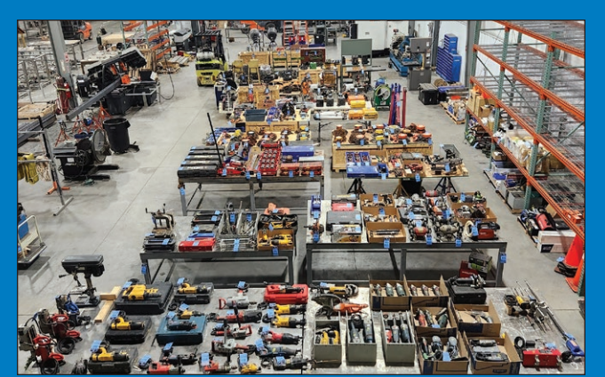
(100+) Lots High Quality Jobsite Contractors Tools