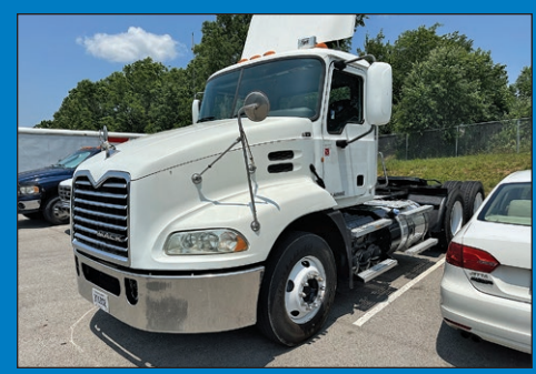
2012 Mack CH613 Road Tractor