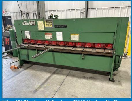
1/4" x 10' Cincinnati Century 2H10 Hydraulic Shear