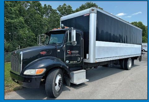
2013 Peterbilt PB337 24' Box Van Truck