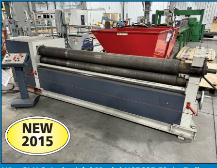
1/4" x 8' U.S. Industrial Model USR825 Plate Roll