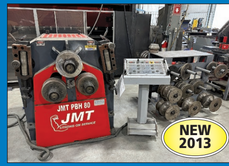
3" x 3" x 3/8" JMT PBH 80 Angle Bending Roll, Tooling