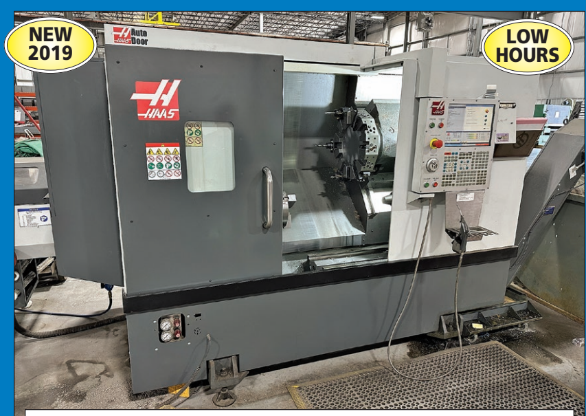
Haas ST-25 CNC Turning Center, Bar Feed