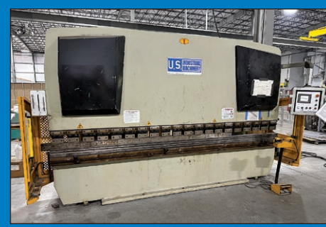
200 Ton x 13' US Industrial 20013AC Hydraulic Press Brake

20" Marvel Spartan Amada Model S20V-Spartan Vertical Band Saw; s/n S20V-269 (3/2021)