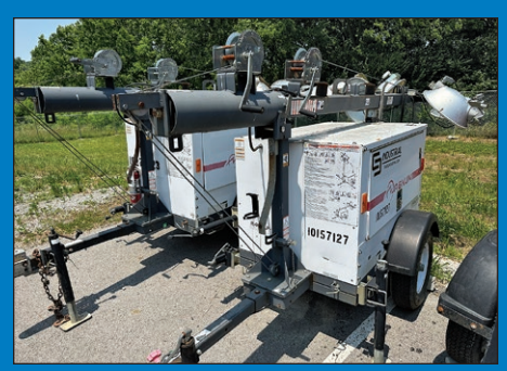
Job Site Tools and Equipment