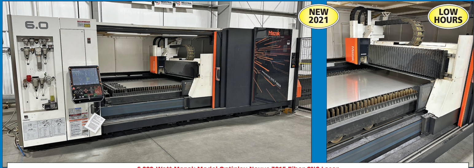
6,000-Watt Mazak Model Optiplex Nexus 3015 Fiber CNC Laser