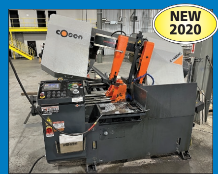
18" x 18" Cosen C460NC-CE CNC Horizontal Band Saw