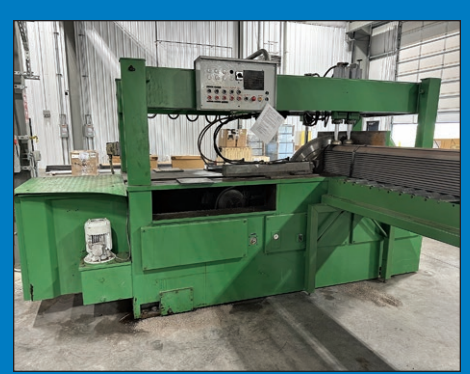
Trennjaeger Upacting Cold Saw