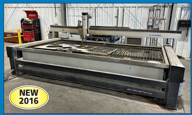
A&V 1206B CNC Waterjet Table, 6.5' x 13' Travels