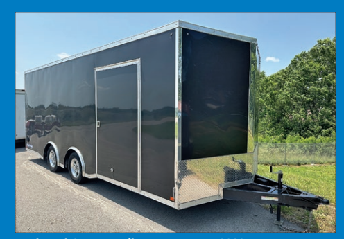
Enclosed Cargo Trailers as New as 2020