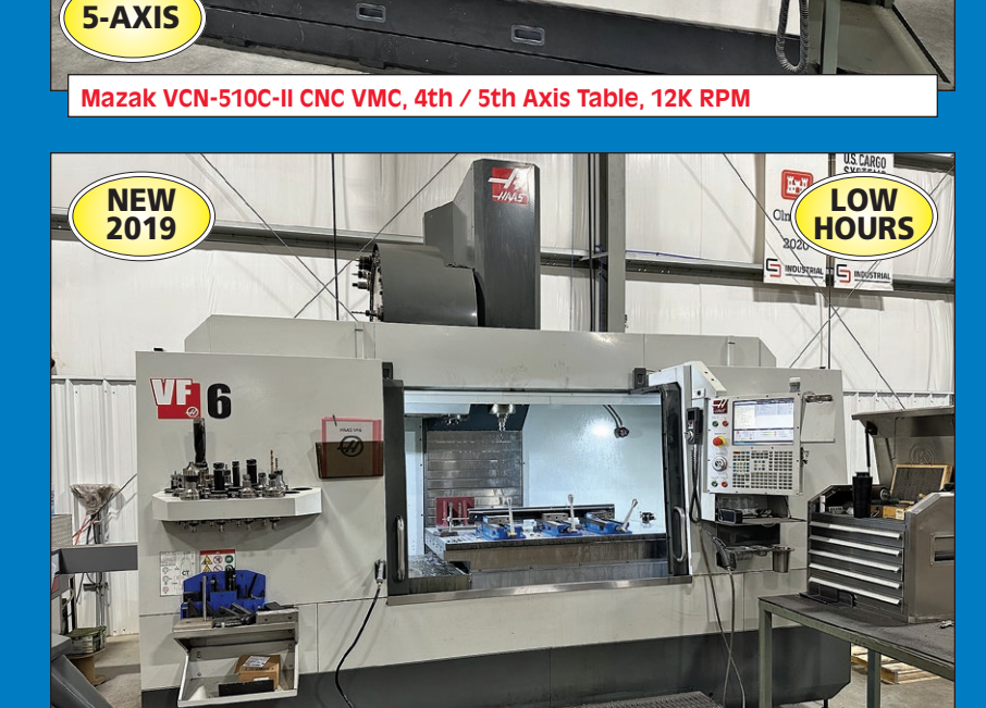
Haas VF-6/50 CNC VMC, 50-Taper

BossLaser Model LS1420 Laser Engraver; s/n 33064, 110-Volt (7/2020)