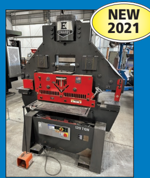
120 Ton Edwards Hydraulic Ironworker