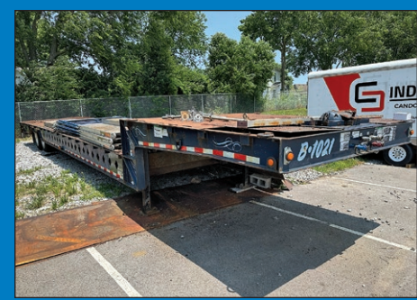
2013 Palomino Muv-All Flip Tail Drop Trailer

2011 Homesteader Type 826HT Enclosed Cargo Trailer; Vin. No. SHABE2628BN009845, Single Wheel, Dual Axle, Swing Door