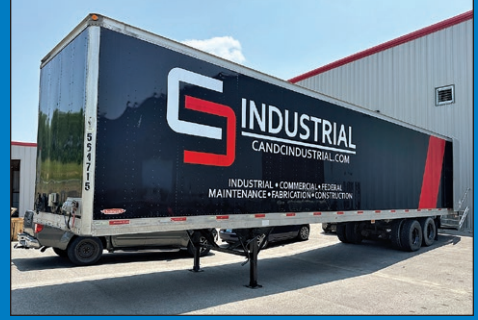
(2) 2008 Trailmobile Van Body Trailers