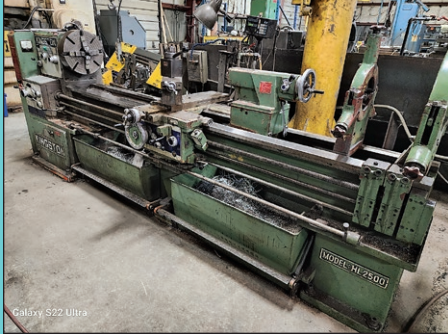
25" x 96" Kingston Model HC2500 Engine Lathe