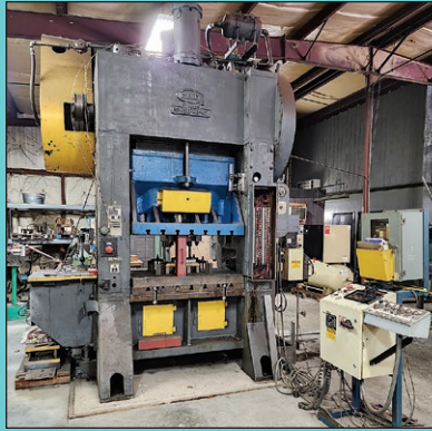
150 Ton Danly Model H2-150-48-42 Straight Side Press