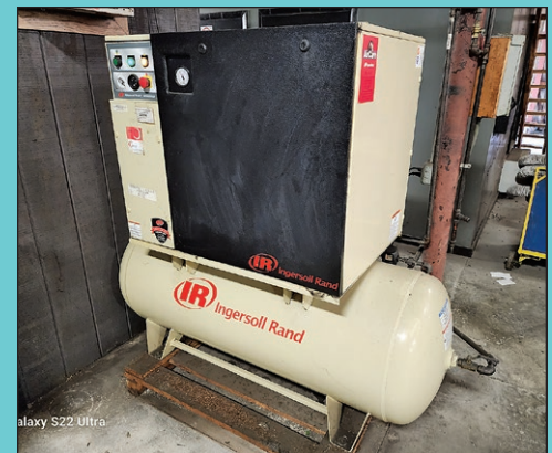
(2) 10 Hp Ingersoll Rand Model UP6-10-125 Advanced Rotary Technology Horizontal Tank Air Compressor, with Air Dryers