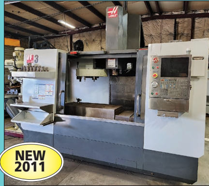
Haas Model VF-3 Model CNC Vertical Machining Center