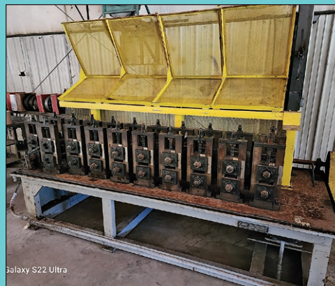
10-stand Mfg. Unknown Roll Former, 10" OC Between Stands, 8" Wide Rolls, Feeder Attachment

Littell HD Single End Powered Uncoiler, 20" Mandrels