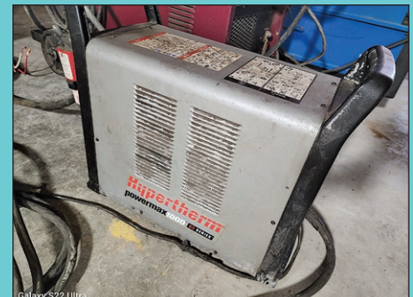
Hypertherm Power Max 1000 Plasma Cutter