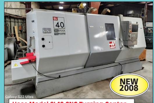
Haas Model SL40 CNC Turning Center