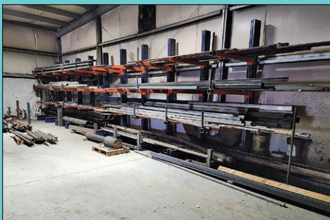
(9) Sections 42" Arm Single Side Cantilever Rack