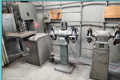
Pedestal Grinders and DoAll Saw