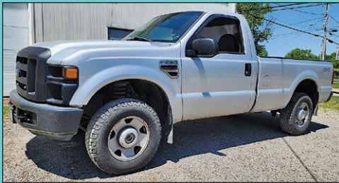
2008 Ford F250 Super Duty Conventional Cab 8' Bed 4-Wheel Drive Pickup Truck

(6) Sections of Various Size Pallet Rack