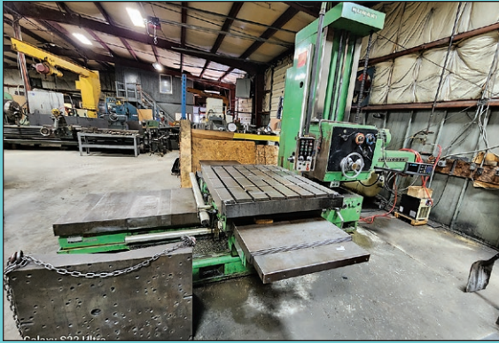
Kuraki Model KBT-1003W Horizontal Boring Mill