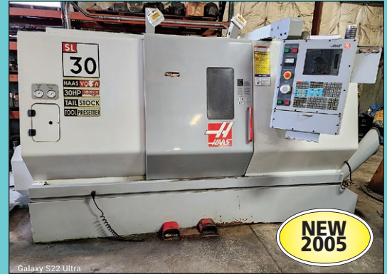
Haas Model SL30T CNC Turning Center