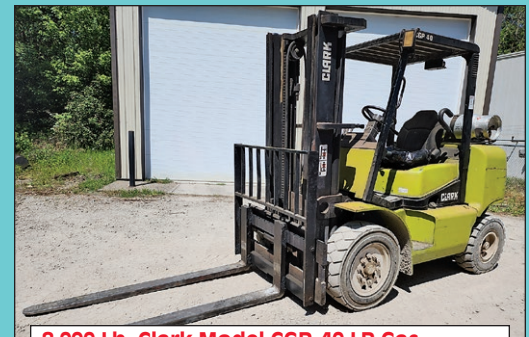
8,000 Lb. Clark Model CGP-40 LP Gas Pneumatic Tire Lift Truck