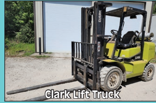
Clark Lift Truck