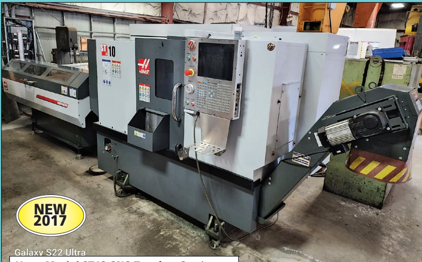
Haas Model ST10 CNC Turning Center