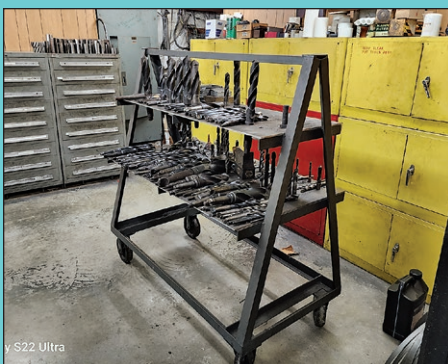
Large Quantity of Tooling