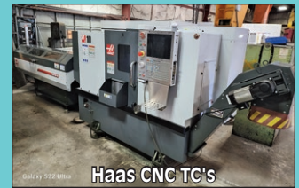
Haas CNC TC's