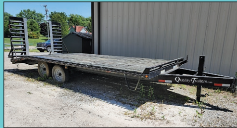
8' Wide x 16' Quality Trailer Tandem Axle Trailer