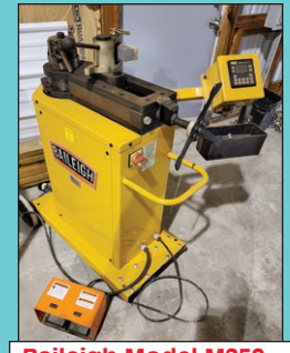
Baileigh Model M250 Tubing Bender