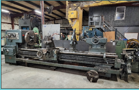
40" x 120" Lodge and Shipley Model 3220-32 Engine Lathe