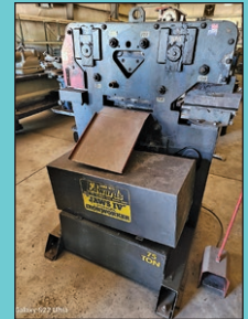
75 Ton Edwards Model Jaws IV Hydraulic Ironworker