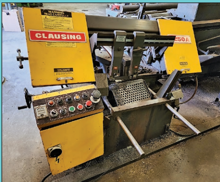
Clausing Model C250A Horizontal Band Saw