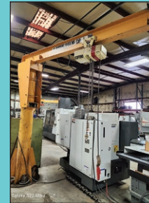
(6) Floor Mounted Rotating Jib Cranes with Capacities From 1/2 to 2 Ton, Electric Hoist by Coffing and CM