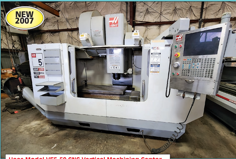
Haas Model VF5-50 CNC Vertical Machining Center

INSPECTION: MONDAY, JUNE 26TH FROM 10:00 AM TO 4:00 PM