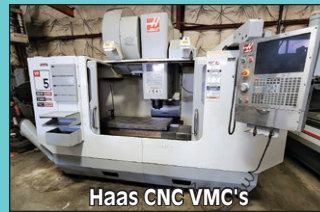
Haas CNC VMC's

Contact Information 2020 Dunlap St. Cincinnati, Ohio 45214 Phone 513-241-9701 Fax 513-241-6760 www.cia-auction.com