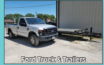
Ford Truck & Trailers