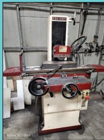
6" x 18" Chevalier FSG-618M