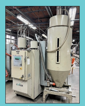
(9) Conair 400 Dryers w/ Hoppers