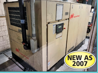
(2) 200 HP Ingersoll Rand Model SSR-EPE200-2S Air Compressors