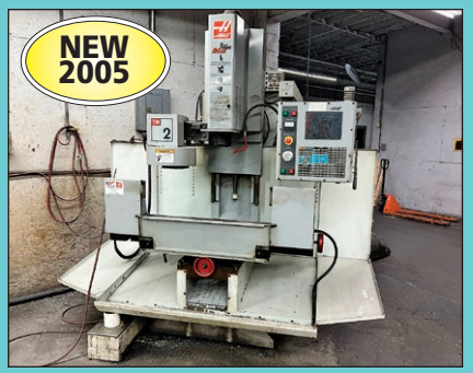
aas Model TM-2 Mini Mill