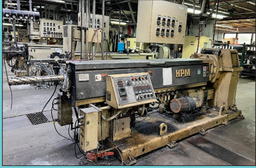
3.5" HPM Model 3.5 TMIII Extruder

(3) 3.5" NRM Model 3.5 Pacemaker 70 Extruders; S/N 12262 (Machine #10), S/N 11368 (Machine #11), S/N N/A (Machine #12), 75 HP Motor, 24:1 L:D