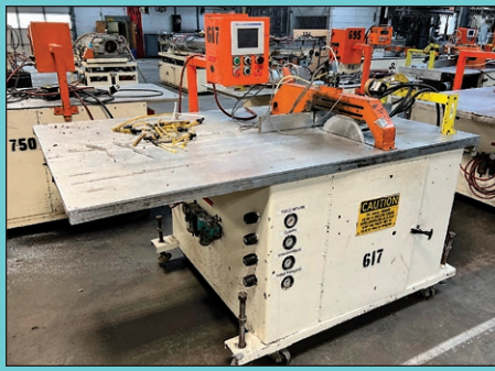
(16) 12"/14" Shop BuiltCross-Cut Traveling Extrusion Saws