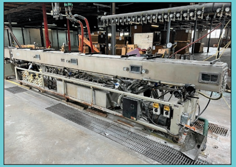
6" Dia. X 23' Conair MVS5-23-6 R-L Vacuum Sizing Tank