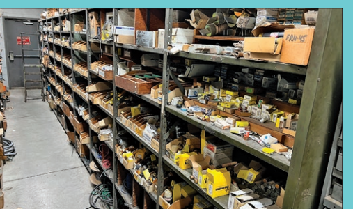
Parts Crib Including; Bearings, Motors, Cords, Electrical, Wire, Fuses, Breakers & More