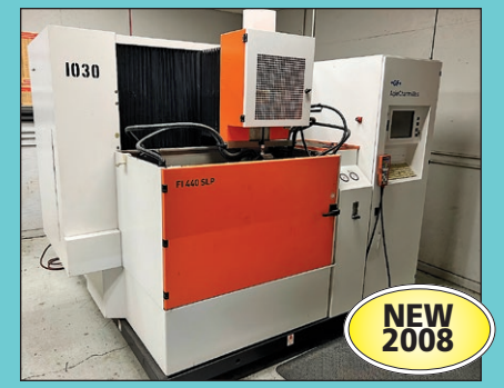
Agie Charmilles Model FI440SLP CNC Wire EDN