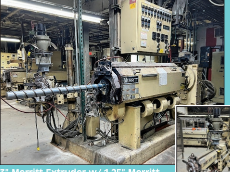
3" Merritt Extruder w/ 1.25" Merritt Co-Extruder