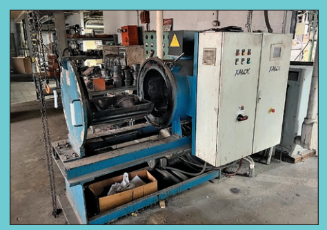
Xaloy Model JCP1724E Jet Cleaner Burn Off Oven