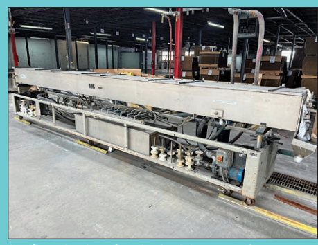
6" Dia. X 21' Conair MCB-21-6 Spray Tank