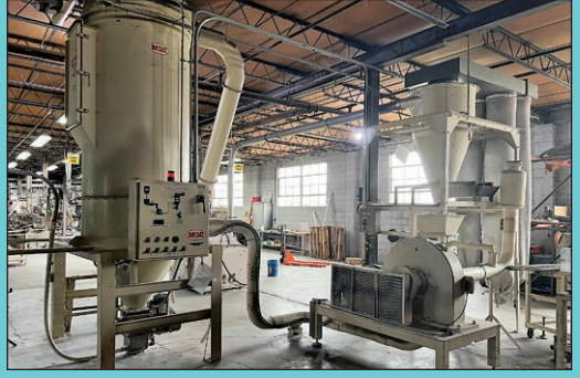
40 HP MAC Pulverizer w/ Cyclone Dust Collector & Mac

Conair Model 610013 Three-Part Blender Conair Model SL03299 Three-