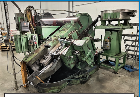
3/4" Waterbury 50 Thread Roller