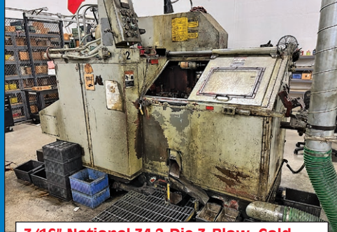
3/16" National 34 2-Die 3-Blow Cold Header