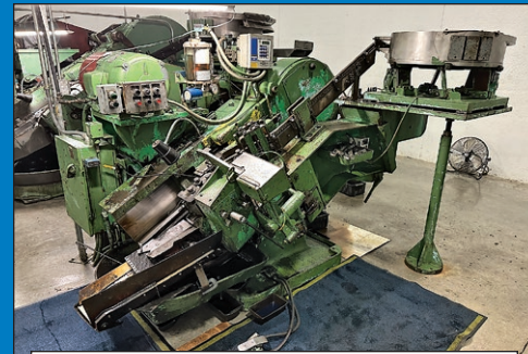
1/2" Waterbury 30 Thread Roller