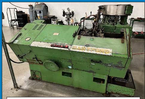
3/8" Hartford 10-400 High Speed Thread Roller