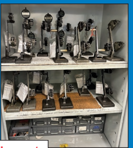
Complete Modern Lab, Keyence Measuring System, Tensile Tester, Hardness Tester and Inspection Equipment