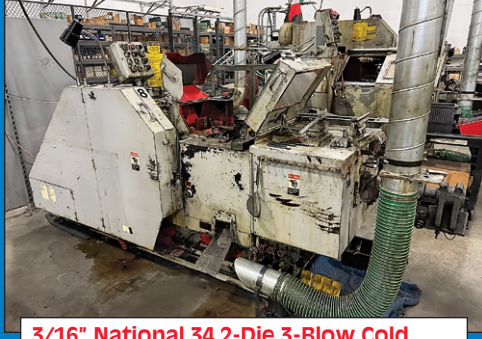
3/16" National 34 2-Die 3-Blow Cold