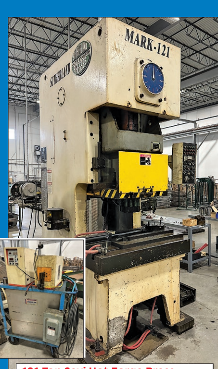
121 Ton Seyi Hot Forge Press, Induction Heat, Sliding Table, Bottom KO, Spring Head