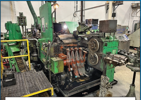
National S-2 4-Die Bolt Maker