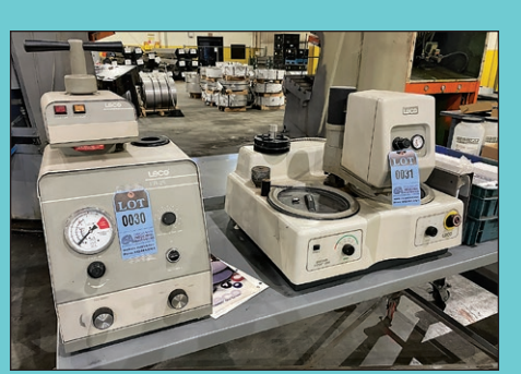
Miscellaneous Lab & Quality Equipment