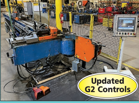
(3) 3" Addison DB76 CNC Hyd. Tube Benders