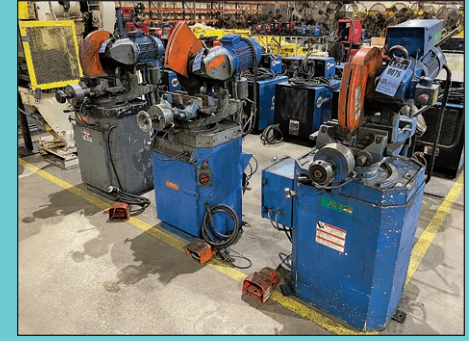
(15+) 12" Cold Saws by Bewo & Scotchman