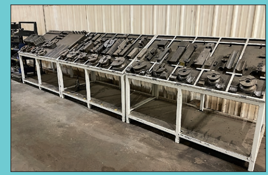
Large Quantity of Various Bending Tooling