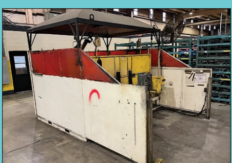
ABB Robotic Welding Cell

Large Quantity of Various End Forming Tooling