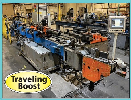
" Addison DB76-TB Traveling Boost CNC Hyd. Tube Bender