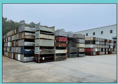
(3,000+) Steel Bins - 78 1/4" Wide x 32" High x 39