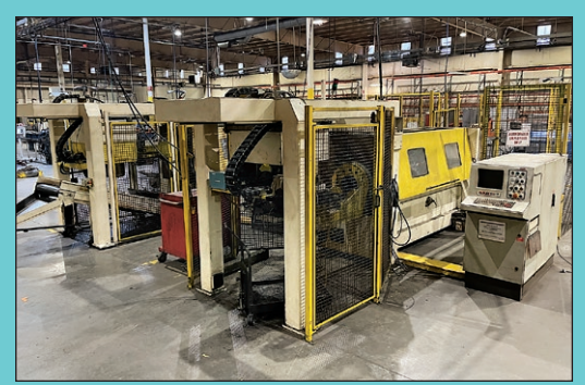
(2) Macsoft Model F412 & F413-49 CNC Wire Benders