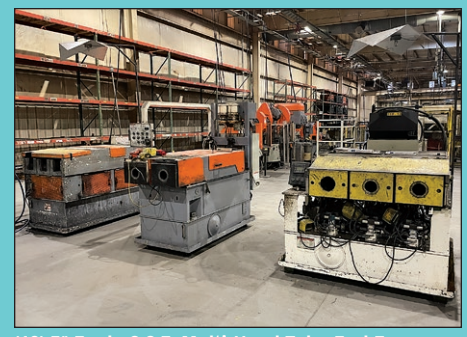
(10) 3" Eagle C.C.E. Multi-Head Tube End Formers