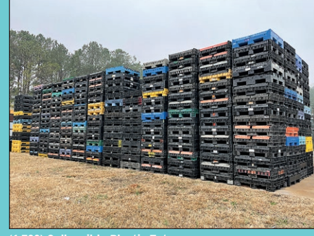
(1,700) Collapsible Plastic Totes