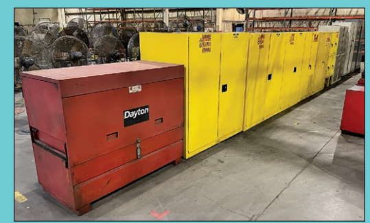
(100+) Lots of Miscellaneous Support Equipment