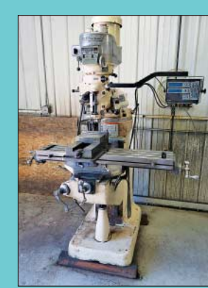
2-HP Bridgeport Vertical Mill