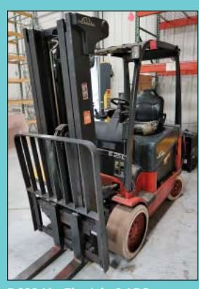
5,000 Lb. Electric & LPG