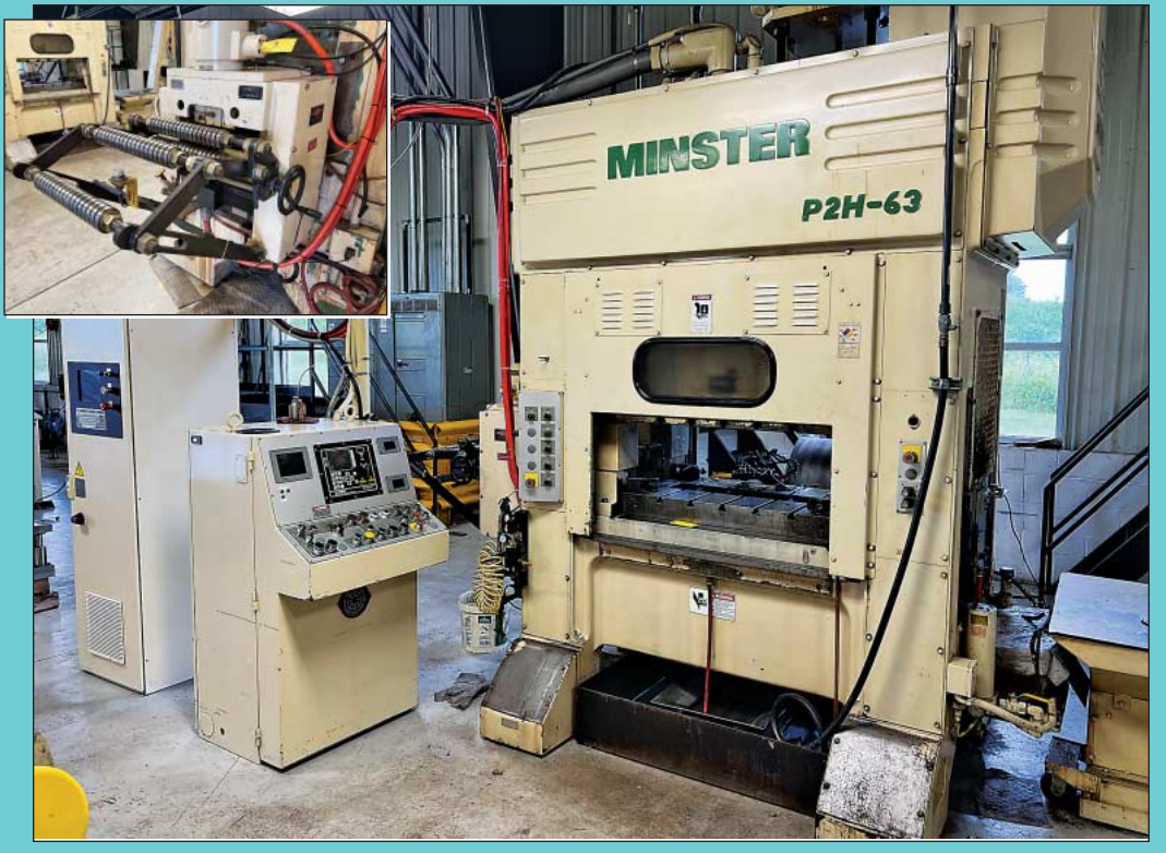
71 Ton Minster Model P2H-63 High Speed SSDC Press w/Vamco Servo Feed