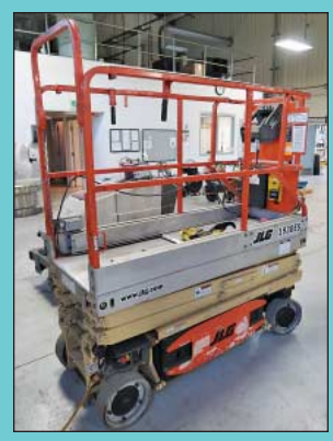
JLG 1930 Electric Scissor Lift