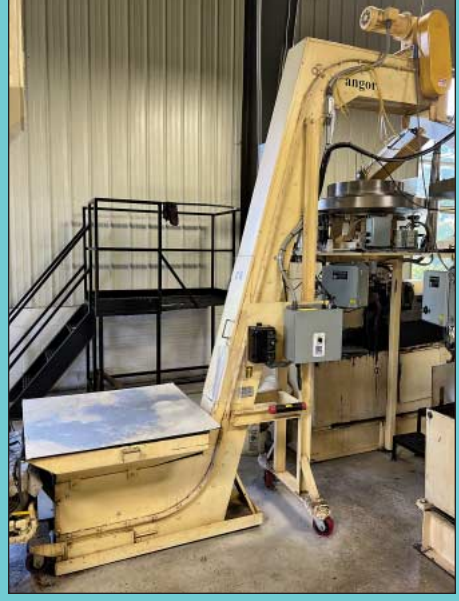
(8) Angor Model AMH-200M Magnetic Conveyor Loaders to 120"

Very Clean Office Furniture and Equipment