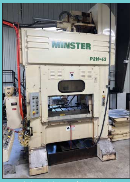
71 Ton Minster Model P2H-63 High Speed SSDC Press