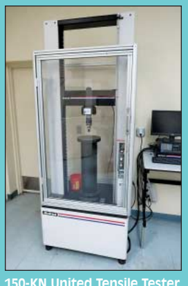
150-KN United Tensile Tester