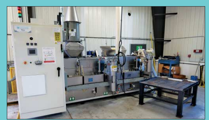
Midbrook Stainless Steel Tumbling Drum Parts Washer