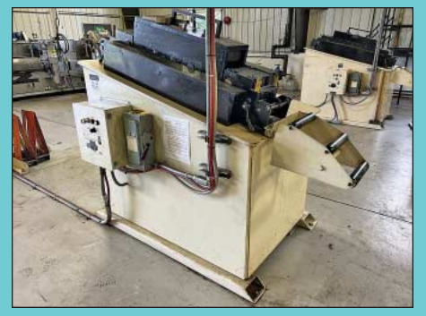
7" Durant Straightener