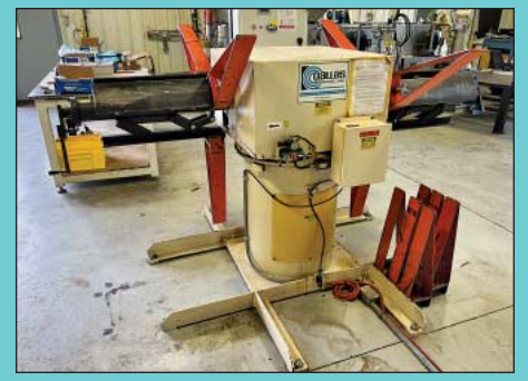
5.000 Lb. Dallas D.E. Uncoiler