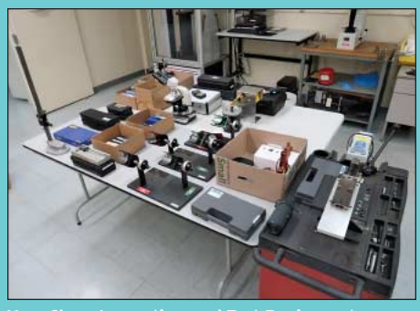
Very Clean Inspection and Test Equipment