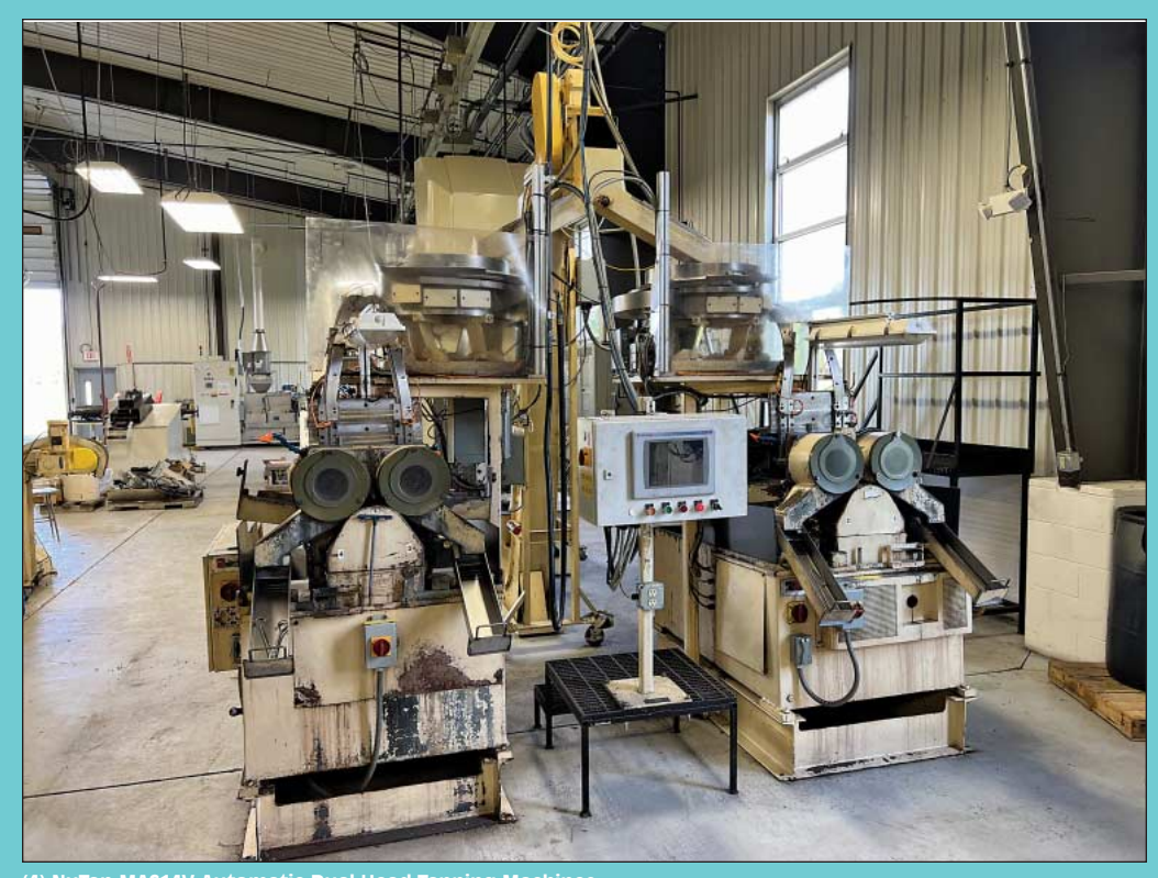
(4) NuTap MAS14V Automatic Dual Head Tapping Machines