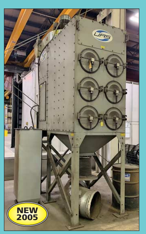
UAS Model SF012-3 Six-Cartridge Dust Collector