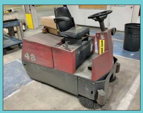
Factory Cat Model 48 Electric Ride-on Sweeper