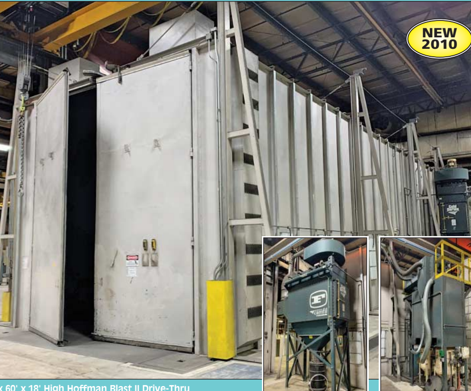
16' x 60' x 18' High Hoffman Blast II Drive-Thru Blast Booth

60 Ton Whitney Model 661ATC CNC Turret Punch & Plasma