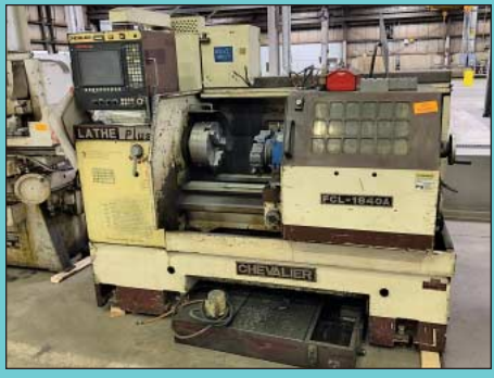
18" x 40" Chevalier Model FCL-1840A CNC Lathe