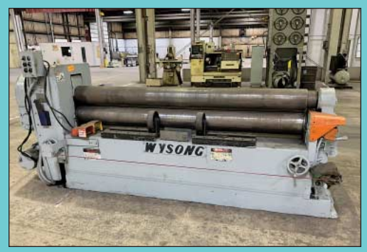
1/4" x 8' Wysong Model F-96 Plate Rolls Hydraulic Plate Bending Rolls

50 Ton Enerpac Model SP-50100 Hydraulic C-Frame Punch Burr King DE Grinders DE Grinders