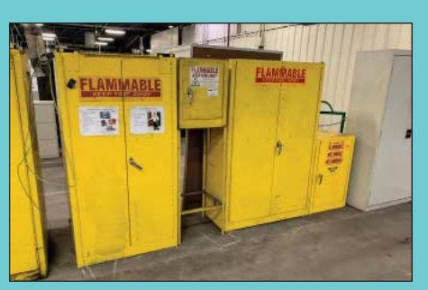
(8) Fireproof Cabinets