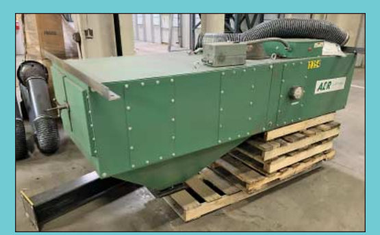
AER Model HCF-3050 Fume Collector