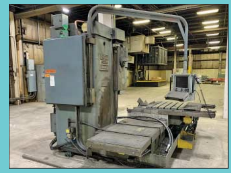
Devlieg Boring Mill

SEAM WELDERS 36" Jetline Model LW-10006 Seam Welder w/ Miller Syncrowave 350 LX Welder; Jetline PLCs, (Retrofitted 2015)