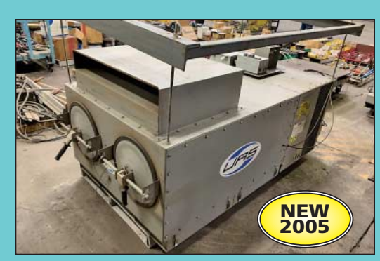
(3) UAS Model SCA Two-Cartridge Fume Collectors