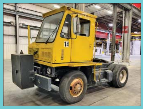
1984 Ottawa Model 50 Spotting Tractor

Shop Equipment Consisting of; Large Drum Fans, Pedestal Fans, Fireproof Cabinets, Binders, Hydraulic Die Cart, Two-Wheel Hand Truck, Misc. Wire, Electrical, Banding Carts, Hardware