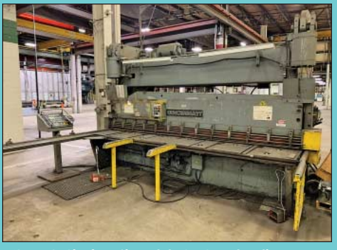
1/2" x 12' Cincinnati Model 4SE12 Hydraulic Power Squaring Shear

18' Subarc Seam Welding System w/ Lincoln DC-600 Welder, Tank Turning Rolls & 40' Track, 60' Seam Track; Lesson Variable Speed Control, Flux Recovery System