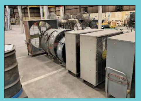
Large Quantity of Drum and Pedestal Fans