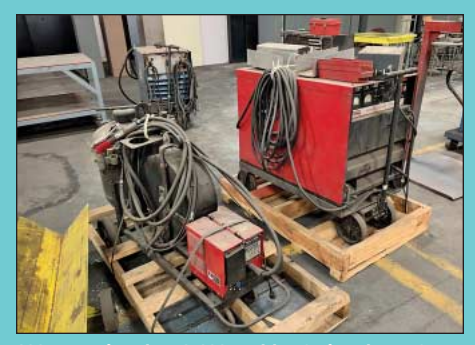
600 Amp Lincoln DC-600 Welder & Lincoln LN-9 Wire Feeder