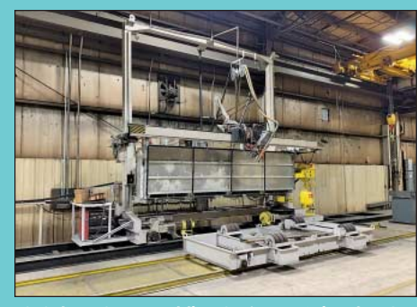
18' Subarc Seam Welding System w/ Lincoln DC-600 Welder, Tank Turning Rolls & 40' Track, 60' Seam Track