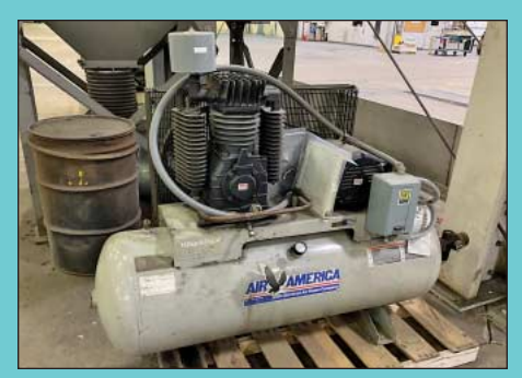
10 HP Air America Horizontal Air Compressor