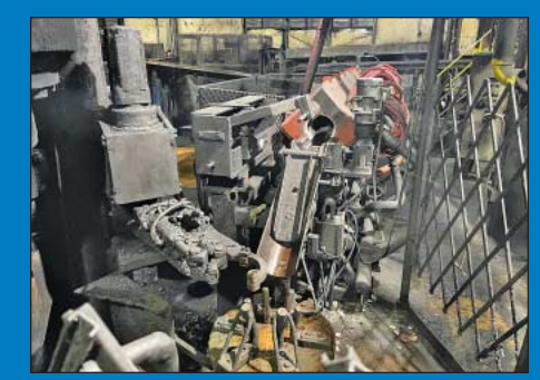
Ajax Pacer Induction Heat Feeders