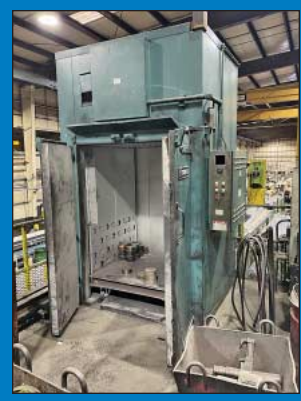
(2) Grieve Electric Furnaces to 850 Deg.