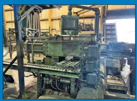
(3) Mitchel Billet Scalping Machines to 200-Ton Cap.