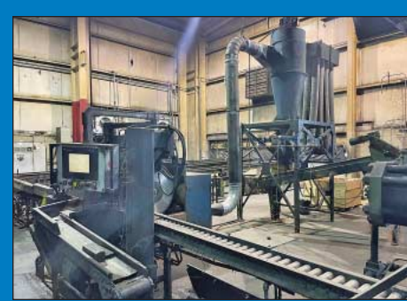
(3) 30" Dia. B&O Automatic Billet Saws w/ Dust Collectors