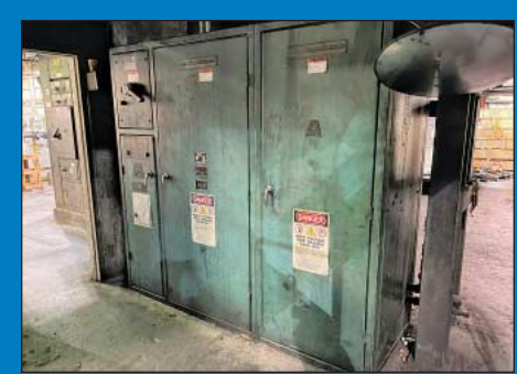
Ajax Pacer Induction Heat Feeder Power Supply