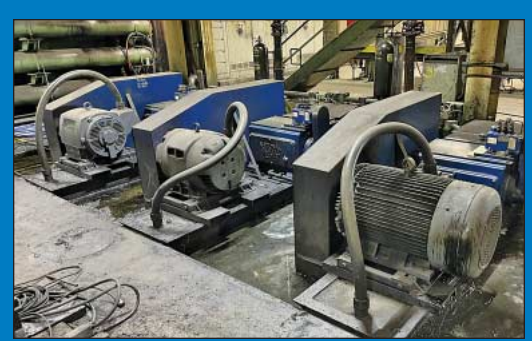
(6) 150 HP National Oilwell Pumps