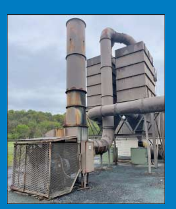
150-HP Wheelabrator Bag House Dust Collector & Blower