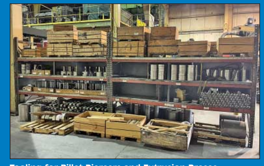
Tooling for Billet Piercers and Extrusion Preses