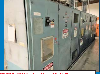
(6) 12,000 Lb. Aiax Magnethermic TET 500-KW Induction Melt Furnaces

(2) Modern Equipment Co. Model XH-600-NM-HE Atmospheric Gas Generators; S.O. No. 18434/07806