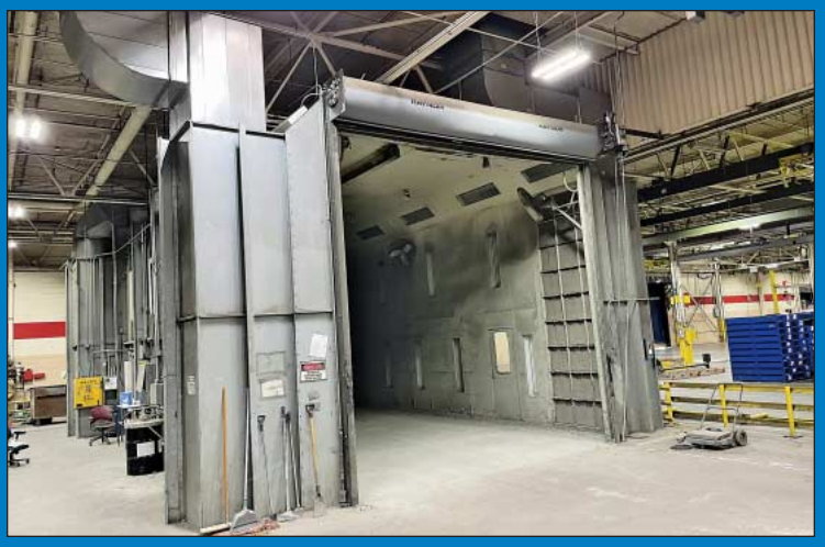
28' W x 45' L x 16' H Pass Thru Paint & Cure Booth