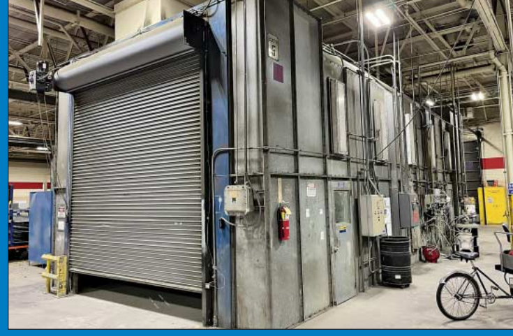
20.5' W x 43' L x 16' H Pass Thru Paint & Cure Booth

(2) 6.000 LB CAT Model GC30K Solid Tire LP Gas Lift Truck; S/N AT83C01240, AT83C01220