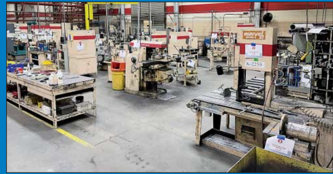
Large QTY Toolroom Machinery