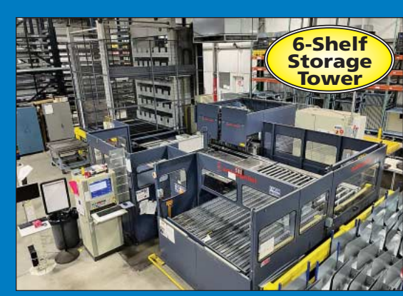
Salvagnini P4 1812 CNC Panel Bender

Model C.P.R. 72 40 .250 Coil Payoff Reel and Car; S/N 91542, 72" W x 40,000 LB; with Holddown Arm; Model C.P.T.B. 72 - .250 Transfer Table; S/N 91621, 72" Wide; Model L.E.G 72 - 0.187 Lateral Edge Guards, S/N 91623; Model C.S. 72 - .250 Crop Shear; S/N 91622, 0.250" Thick x 72" Wide; Herr-Voss Keystone Leveler L.H. 84/2.187-19/7 4 Hi; S/N 14296, 5-Independent Position 125 HP Philadelphia Motor; Model D.H.E.T. 72 - 0.135 Dual Head Edge Trimmer, S/N 91625, 0.135 x 1.25 Per Side at 50,000 PSI Shear; Model S.C. 72 - 0.135 Scrap Shute, S/N 91626, 0.135 x 1.25 Per Side at 50,000 PSI Shear; Model S.C.V. 72 Scrap Conveyor; S/N 91627; Model Q.R. Quadrant Roll- Loop Pit, S/N 91628, 72" x 0.135" Thick; Model Roll Feed, S/N 91558, 0.187" Thick x 72" Wide High Speed Shear; 72" x 144" Model S.U. Side Disch. Stacking Unit, S/N 91630, 12' x 72"