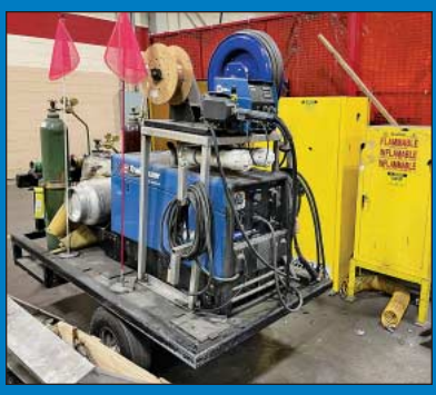
Miller Trailblazer 302 Welder/Generator