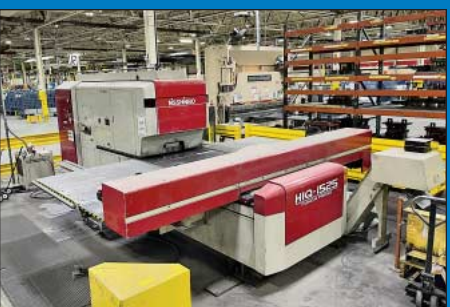
30 Ton Nisshinbo HIQ 1525 CNC Turret Punch Press