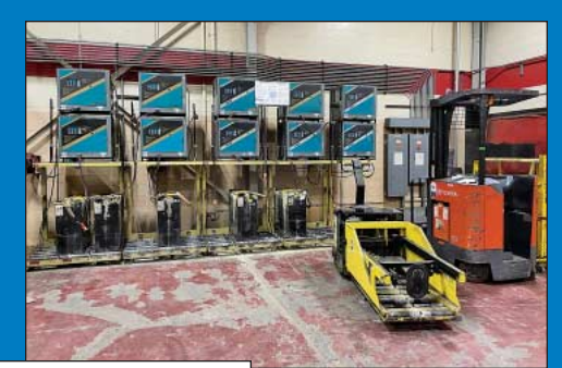
Floor Scrubbers & Sweepers, HD Electric Battery Charging Stations