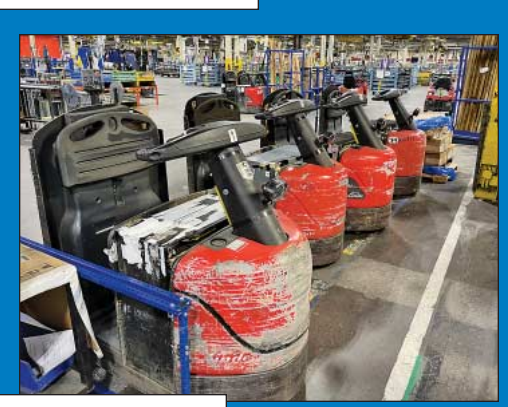
(25+) Electric Pallet Jacks, Golf Carts & Various Tuggers