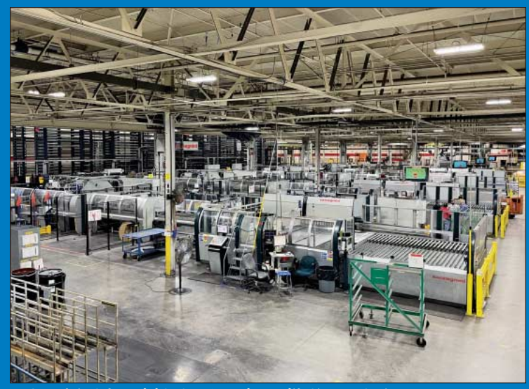
(4) Complete Salvagnini S4 & P4/P4X Lines with Storage System* *SUBJECT TO WITHDRAW WITHOUT NOTICE