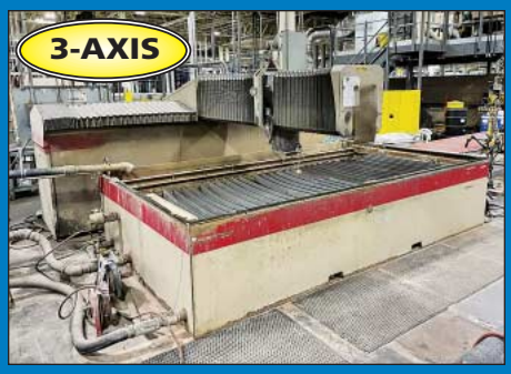
(1 of 3) 6' x 12' Flow CNC Flying Bridge Waterjet Tables