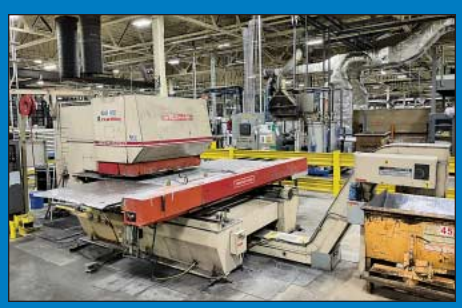
50 Ton Wiedemann Magnum 5000 CNC Turret Punch Press