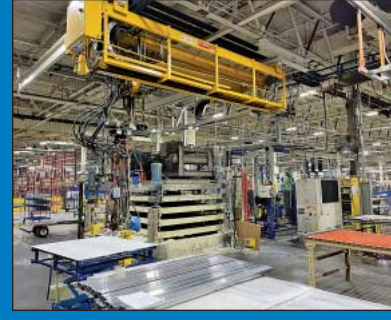
Krauss Maffei 5-Platen Foam Panel Press*

(2) Robopac Self Propelled Robot Stretch Wrappers