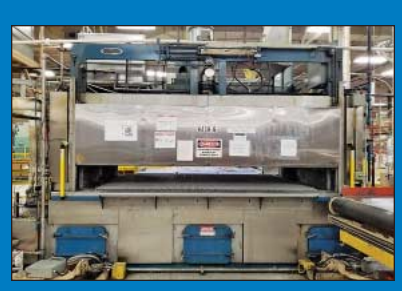
(1 of 2) 72" Continental Wash/Rinse/Blow Systems