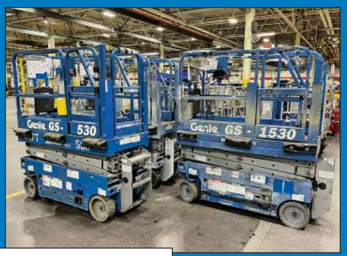
(20+) Electric Man Lifts & Scissor Lifts by Genie & Skyjack