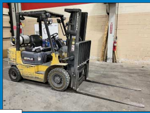
(30+) Lift Trucks by CAT, Hyster & Toyota up to 10,000 LB