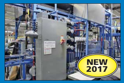
Coil Auto Braze System