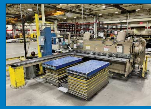
(1 of 2) 1/4" x 10' Cincinnati Shears