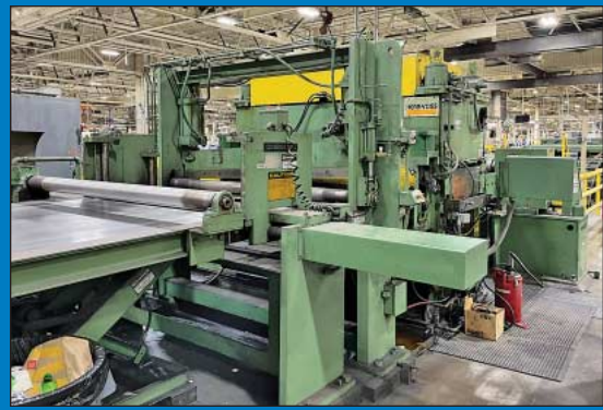
Herr-Voss Keystone Leveler L.H.84/2.187-19/7-4-Hi