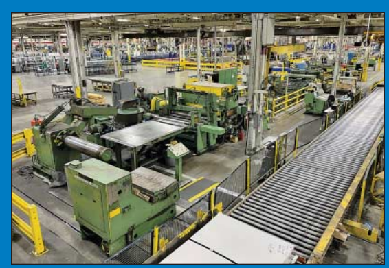
72" x 40,000 LB x 0.135" Cincinnati CTL