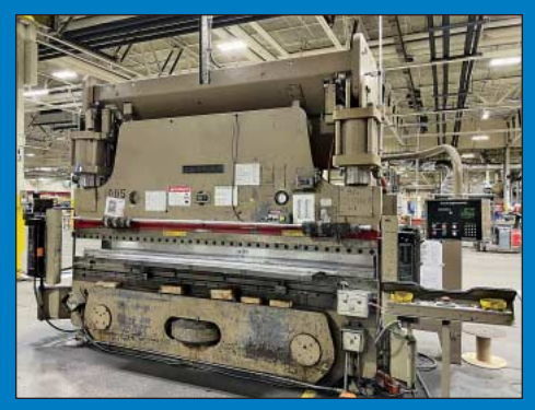
230 Ton x 12' Cincinnati Autoshape CNC Press Brake