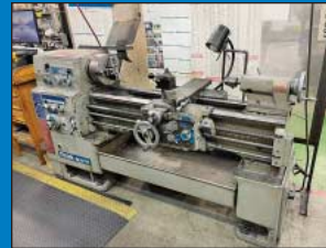
14" x 40" Mazak Lathe