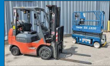
5,000 Toyota & Genie GS-1530