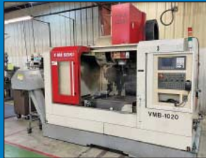
Yama Seiki VMB-1020 CNC VMC