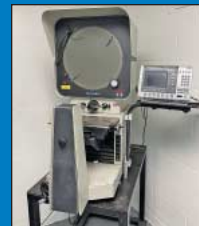
14" Deltronic DH214 with DRO