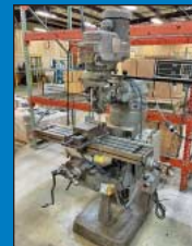
2 HP Bridgeport Mill