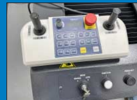
Mitutoyo CRYSTA-Apex S776 CMM with Renishaw Probes