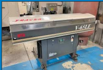
60" MTA V65LE Tracer Bar Feed