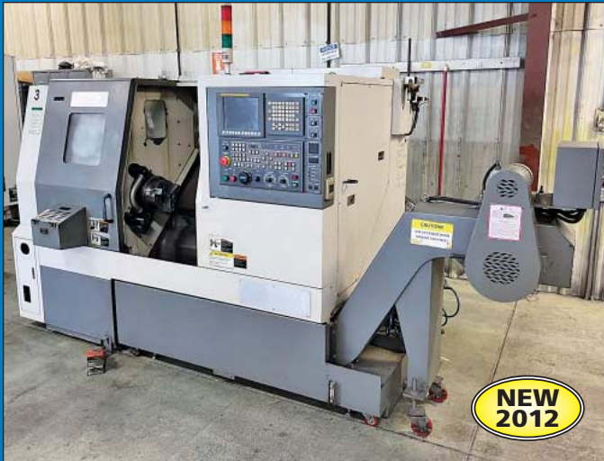
(1 of 2) Samsung SL25/500 CNC TCS

See website www.cia-auction.com For Detailed Specifications, Photos, Link To Online Bidding And Terms Of Sale.