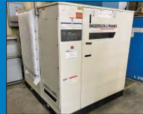
75 HP IR Air Compressor