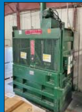
Philadelphia Vertical Baler