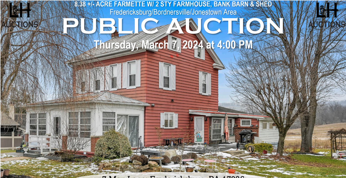
7 May Lane; Fredericksburg, PA 17026