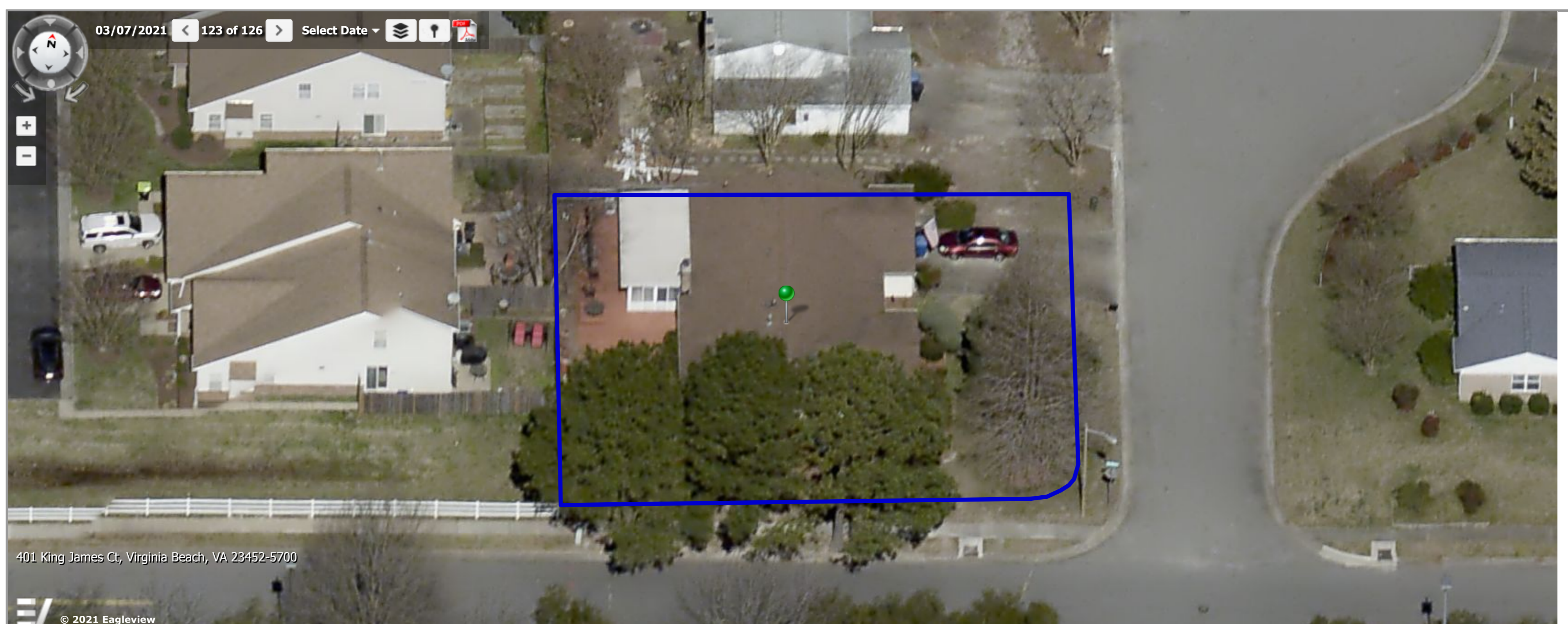
401 King James Ct, Virginia Beach, VA 23452-5700