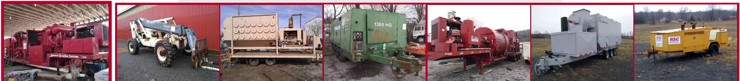
FEATURED LOT #100