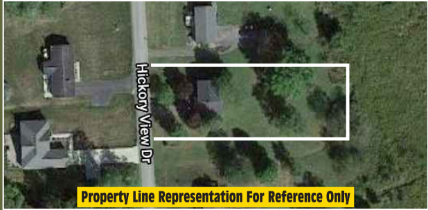
Property Line Representation For Reference Only