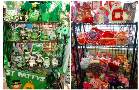
St. Pats & Valentines