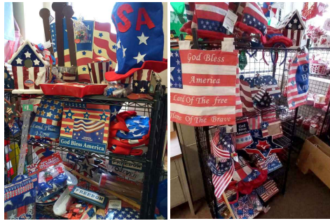
Patriotic & Summer