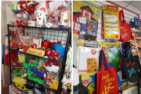
Teacher & Classroom