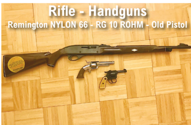
Rifle - Handguns

Remington NYLON 66 - RG 10 ROHM - Old Pistol