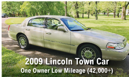
2009 Lincoln Town Car One Owner Low Mileage (42,000+)

Remington NYLON 66 - RG 10 ROHM - Old Pistol