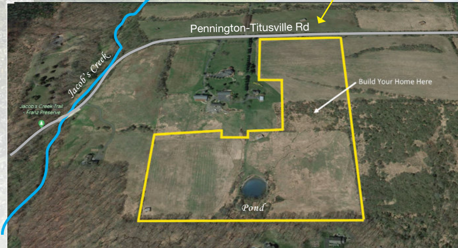
362 Pennington-Titusville Rd, Hopewell Township, Mercer County, NJ 08525

Online Bidding Concludes Thursday, October 26, 2023 at 11 am