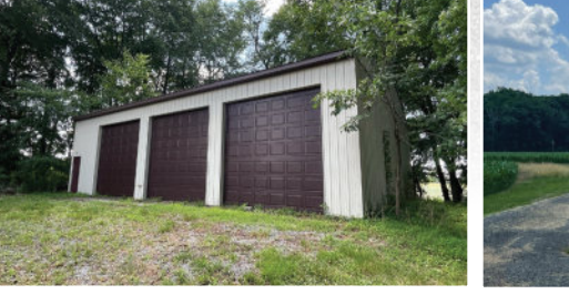
Ready for a Productive 2024!