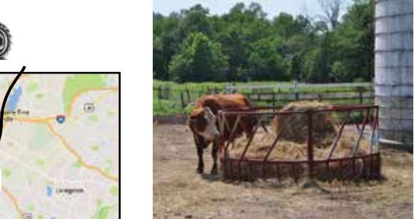
Bring your Livestock!