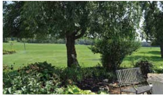
Enjoy Country Breezes and Picturesque Sunsets