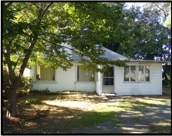
4220 W. Hopewell Road Center Valley, PA 18034-9426