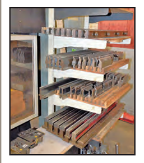
Large Quantity of American and European Style Brake Dies