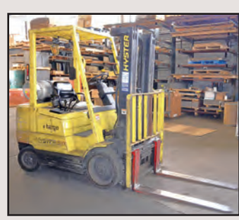
4,500-Lb. Hyster Mdl. S50XM Propane Forklift