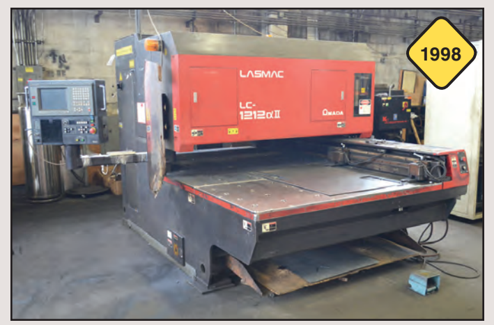
1.5Kw Amada LC1212A2 Pulsar Hybrid Laser

CUSTOM METAL FABRICATORS 56-01 55th Avenue, Maspeth, New York (Queens) 11378