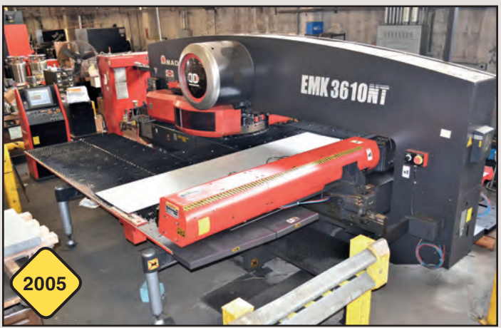
33-Ton Amada EMK3610NT Electro Servo Turret Punch

56-01 55th Avenue, Maspeth, New York (Queens) 11378