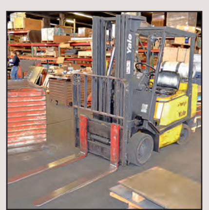
5,800-Lb. Yale Mdl. GLC060TENUA083 Propane Forklift