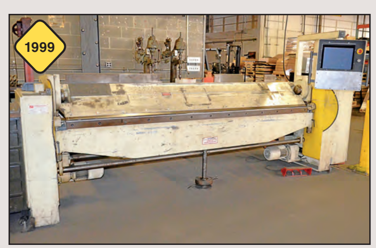
14Ga. x 10' Roper Whitney Mdl. AB1014KC Kombi CNC Folder