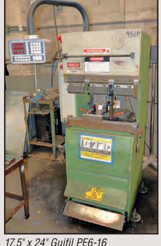
138-Ton x 10' Amada RG-125 CNC Press Brake CNC Press Brake