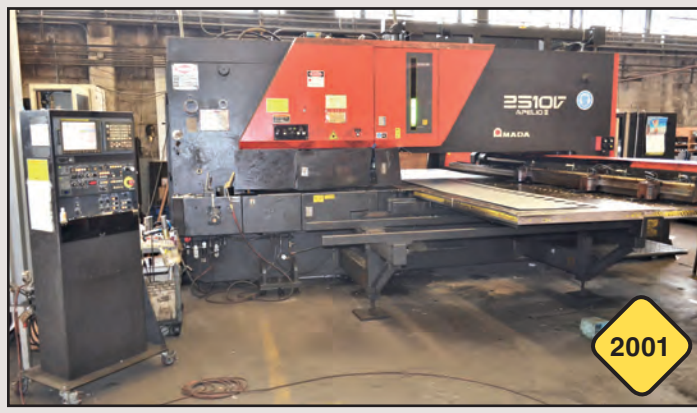
Amada Apelio III 2510-V 22 Turret Punch/2Kw Laser Combination