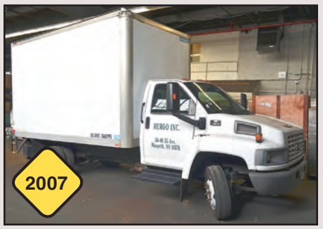
Chevy C4500 Box Truck

Miscellaneous Welding Accessories Incl. Tables, Clamps, Welding Curtains, Tips, Torches, Hoses, Kemper Fume Collector, Etc.