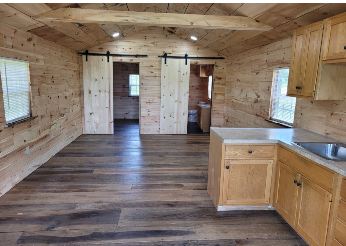
2 PARCELS OF PRIME HUNTING GROUND w/CREEK—Excellent opportunity to own your own cabin with abundance of wildlife. Parcels are mostly wooded with several locations for food plots.