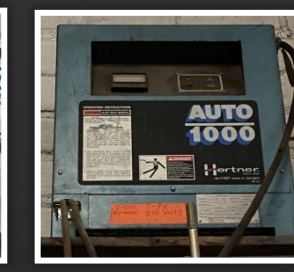
Terms: Cash, check or debit/credit card on day of auction. A 3% buyer's premium will be charged, with a 3% discount for payment by cash or check. All items are selling on an "AS-IS" basis. For checks written in the amount of $1,000 or more, a $500 credit card authorization will be required.