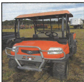
2005 KUBOTA RTV900 VEHICLE - 2500 HRS. DIESEL 4X4