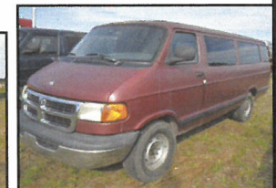
1998 DODGE RAM 3500 PASSENGER VAN - 199,989 MILES