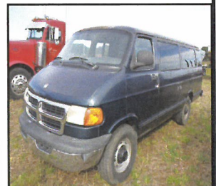
1998 DODGE RAM 3500 PASSENGER VAN - 138,000 MILES