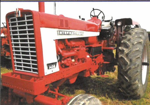
1971 INTERNATIONAL FARMALL 1456 - 8,449 HRS. - REPAINTED - DUAL PTO'S - 2 CYL. HOOKUPS - DRAW BAR - NEW SEAT - S/N 2650112U015162