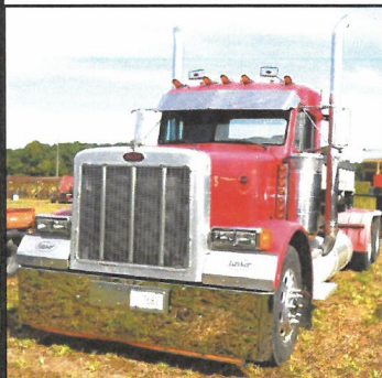
1997 PETERBILT 379 TRACTOR, 1,226,189 MILES - DAY CAB - FULLER EATON TRANSMISSION CHELSEA PTO - DETROIT DIESEL SERIES 60 ENGINE - FONTAINE 5TH WHEEL - LOTS OF CHROME - SHARP FOR AGE