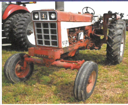
1972 INTERNATIONAL FARMALL 666 - 7,846 HRS. - PTO - DRAW BAR - CYL. HOOKUP - S/N 245015U007963