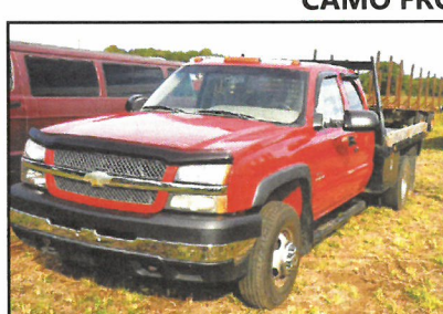
2003 CHEVROLET 3500 DURAMAX, 137,769 MILES RED - 6.6 TURBO DIESEL - AUTOMATIC - RAWSON-KOENIG STEEL FLATBED - GOOSENECK BALL