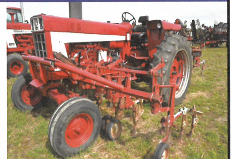
1973 INTERNATIONAL FARMALL 666 - 8,272 HRS. - 4 ROW FRONT CULTIVATOR - 3 ROW REAR CULTIVATOR - 2 CYL. HOOKUPS - REPAINTED - NEW SEAT - NO DECALS - S/N 2450151U009161