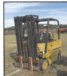
CATERPILLAR T50D FORKLIFT - 4 POST ROLL GUARD - HARD TIRE