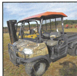
KUBOTA RTV900 UTILITY VEHICLE 2499 HRS. DIESEL CAMO FRONT