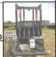
Shop Made Tobacco Press

View Equipment at Intersection of Pled Wade Rd. & Osage Rd. Puryear, TN on Sunday Nov. 10th from 1 to 4 p.m.