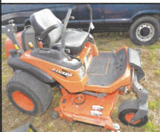
KUBOTA ZD326 ZERO-TURN MOWER - PRO 60 COMMERCIAL MD. RCK60P - 1,799 HRS.