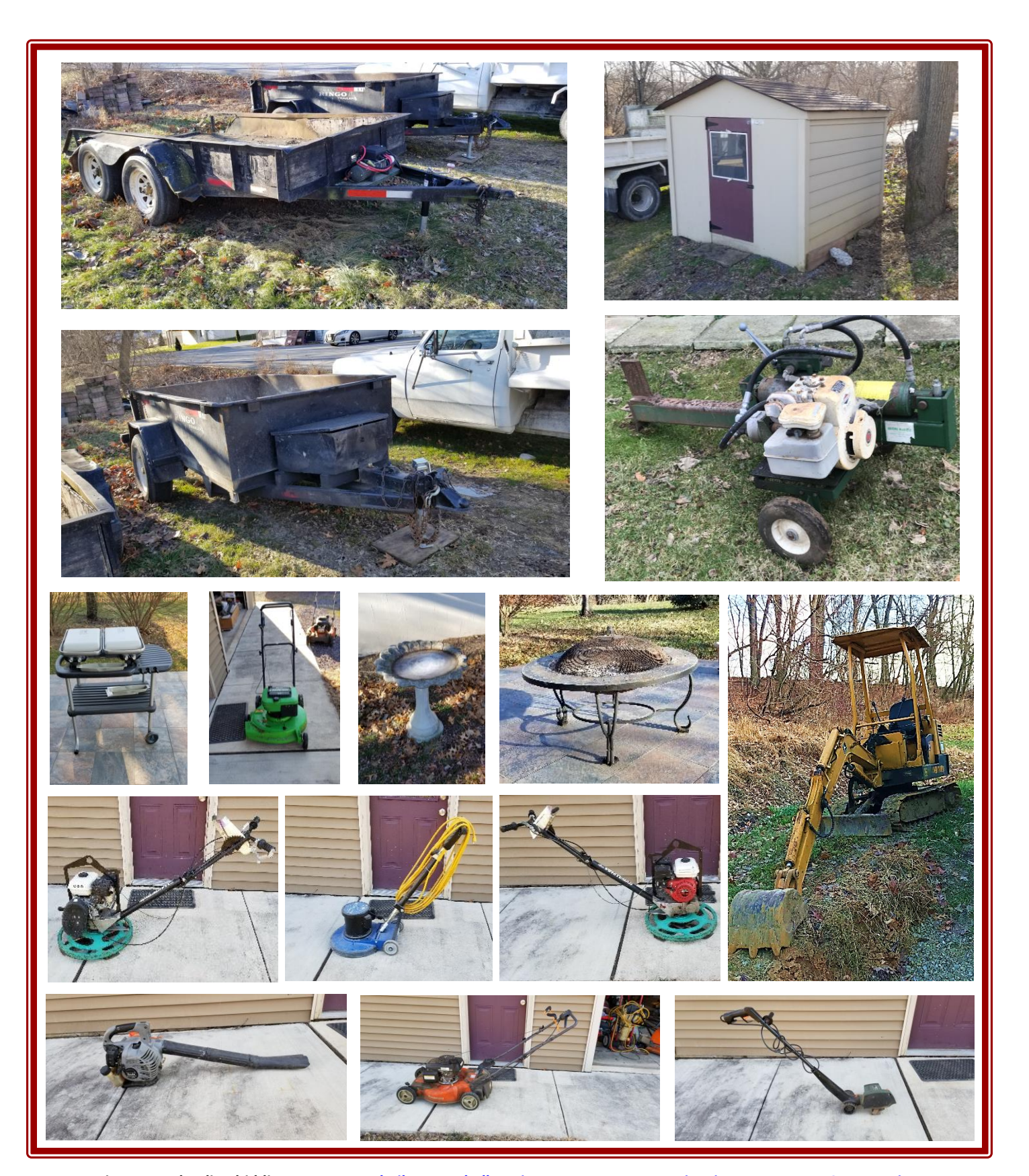
\textbf{For more pictures and online bidding go to:} \ \underline{\textbf{www.beiler-campbellauctions.com}} \ \ \textbf{or} \ \underline{\textbf{www.auctionzip.com}} \ \ \textbf{or} \ \underline{\textbf{www.GoToAuction.com}}