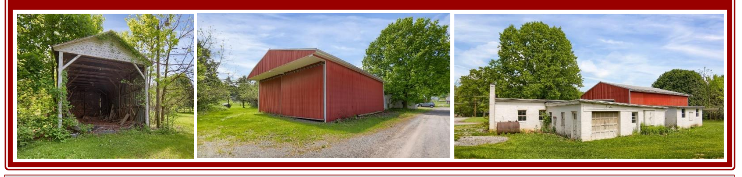
Directions: From Rt 322 E take the exit towards Port Royal then left onto William Penn HWY. Property will be on the right. Watch for signs!

00 William Penn HWY, Mifflintown, PA 17059