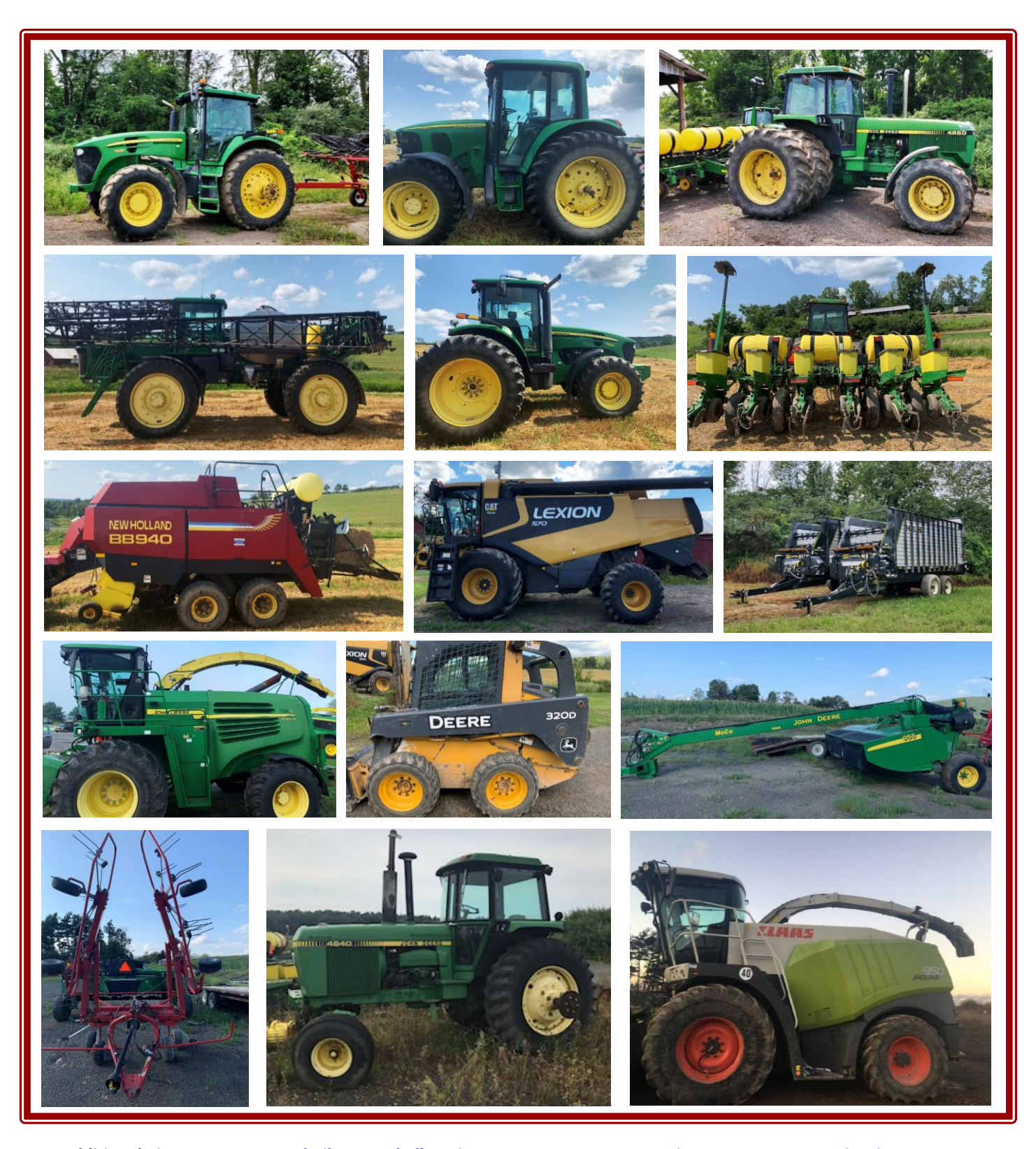
For additional pictures go to <u>www.beiler-campbellauctions.com</u> or <u>www.GoToAuction.com</u> or <u>www.auctionzip.com</u> ID# 23383