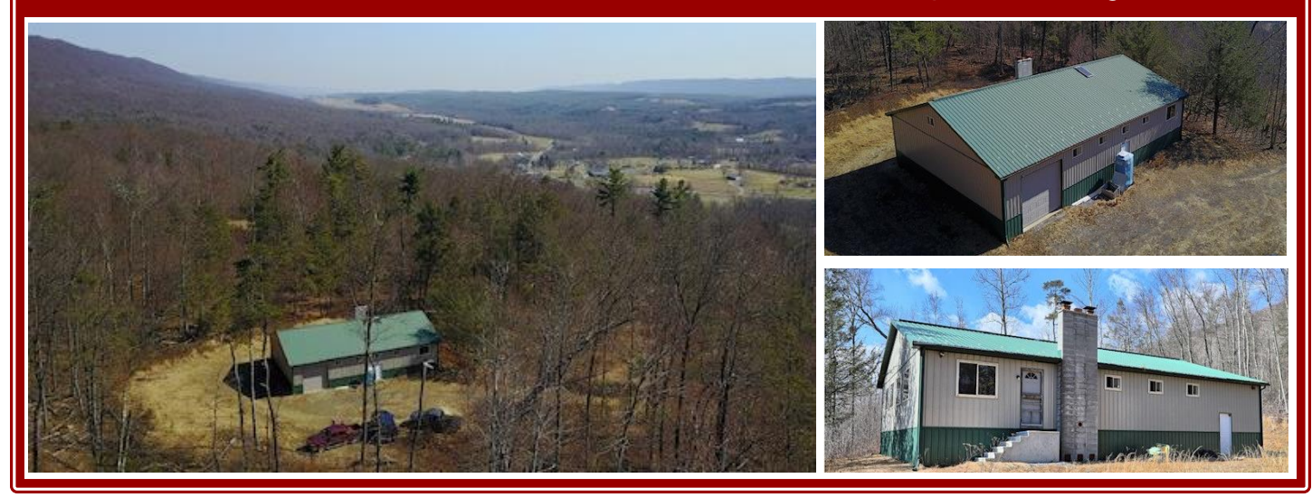
Directions: From Pa Turnpike take exit 180 (522). Turn right toward Mt Union. Go approx. 12 miles to town of Shade Gap. Turn left onto Main Street. Watch for auction signs.

21270 Main Street, Shade Gap, PA 17255- Huntingdon County