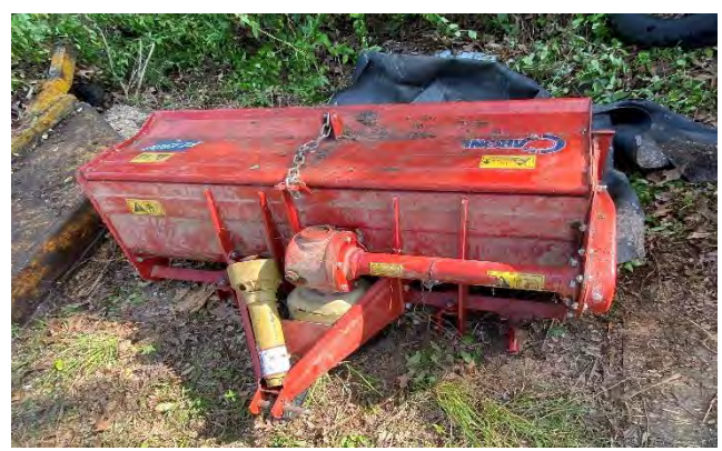
Auctioneers Note : This is a good sale with a lot of good Tools, Equipment and building supplies. Hope to see you on the 25th. Bill.