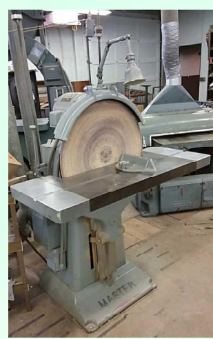
REALESTATE- INDUSTRIAL BUILDING MACHINE SHOP & WOODWORKING EQUIPMENT

Wednesday October 24, 2018, 10AM 2266 Smead Ave. Toledo, OH 43606