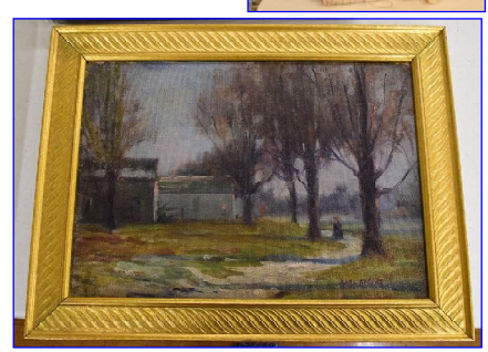
GLASSWARE-COLLECTIBLE-ARTWORK AUCTION FRIDAY AUGUST 31, 2018 @ 10AM.