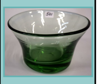
501 Dominick Labino 1968 early green bowl 7" diam, 4.5" tall

LABINO ~ Baker ~ Applebaum ~ Steuben ~ Lotton Whalen Auction Bldg, 8020 Manore Rd, Neapolis OH (gps use Grand Rapids OH 43522) Exit 63 off St Rt 24 to west on St Rt 64, towards Whitehouse, turn south on Finzel Rd to dead end into Neapolis-Waterville Rd, turn right (west to corner of Manore).