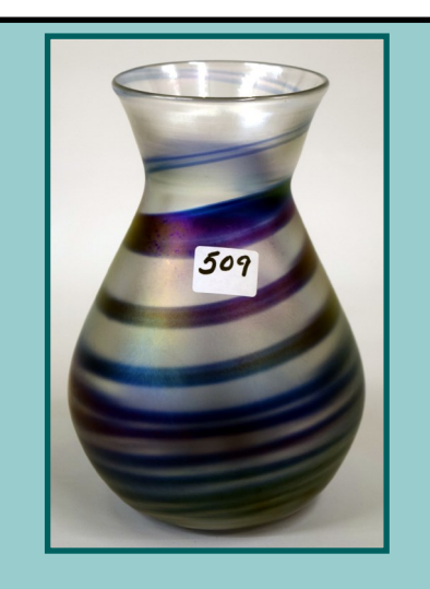
509 Baker O'Brien 1988 clear satin vase, swirled with bluepurple design