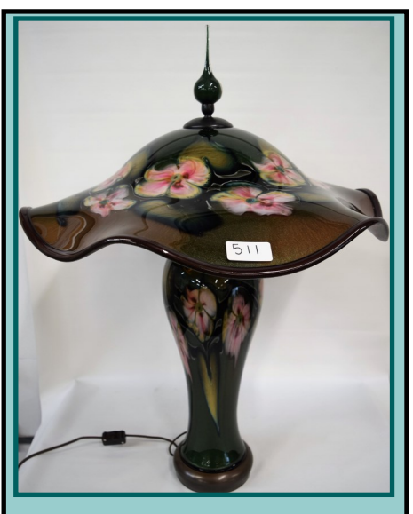
511 Charles Lotton Multi-Flora green lamp, signed, 1997, 23" shade