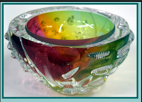
510 Leon Applebaum bowl, red yellow green textured surface, heavy, 8" diam, 5" tall

Open: week of auction from 8-3pm and Thursday August 20 from 6-8pm., day of auction at 8:30am.