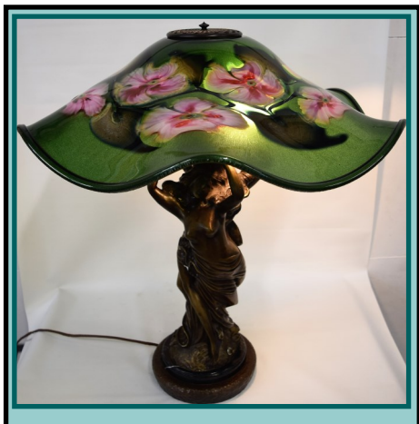
512 Charles Lotton Multi-Flora green lamp, signed, 2001, 22" shade w/bronze figural base.