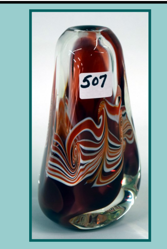
507 Baker O'Brien 1983 Triplicate vase, red and clear, swirls of orange-red-white 5"

Open: week of auction from 8-3pm and Thursday August 20 from 6-8pm., day of auction at 8:30am.