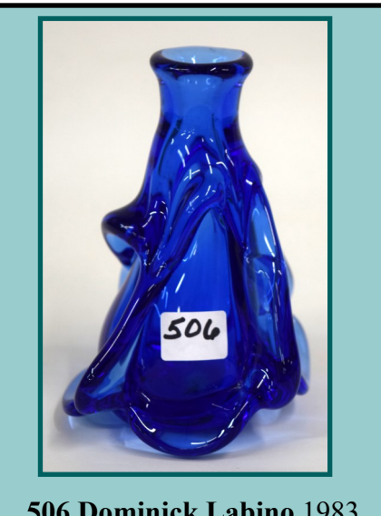
506 Dominick Labino 1983 blue vase, pinched pulled classic design 5"