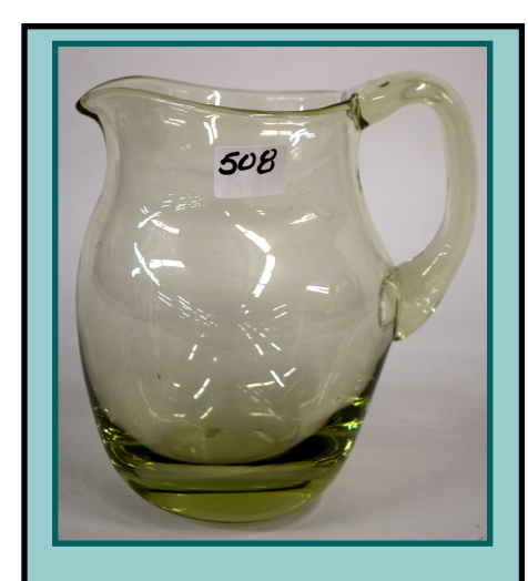
508 Dominick Labino 1968 early green pitcher, applied handle, 5.5"