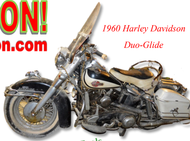
1960 Harley Davidson